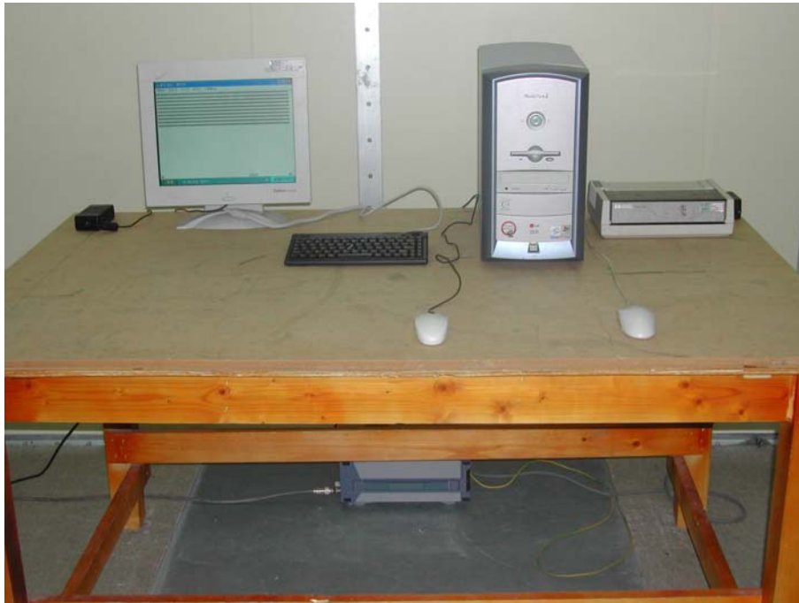
Photograph 1: Setup for Conducted Emissions