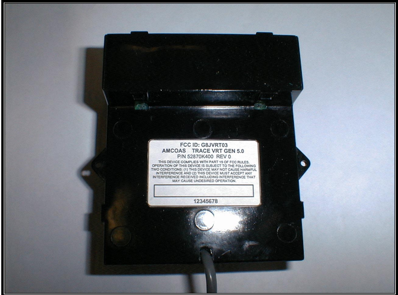
PHOTOGRAPH 2: LOCATION OF LABEL ON BACK OF TRANSPONDER

Please refer to the following page for the label sample.