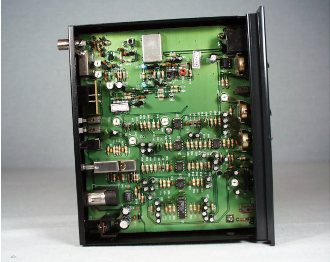
Inside view of the Venture-Base