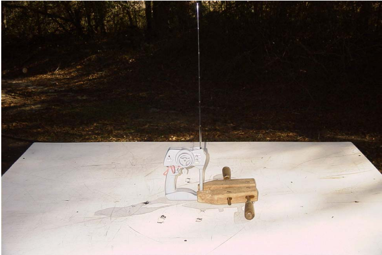
TEST SET UP PHOTO

888.472.2424 F 352.472.2030 email: tei@timcoengr.com