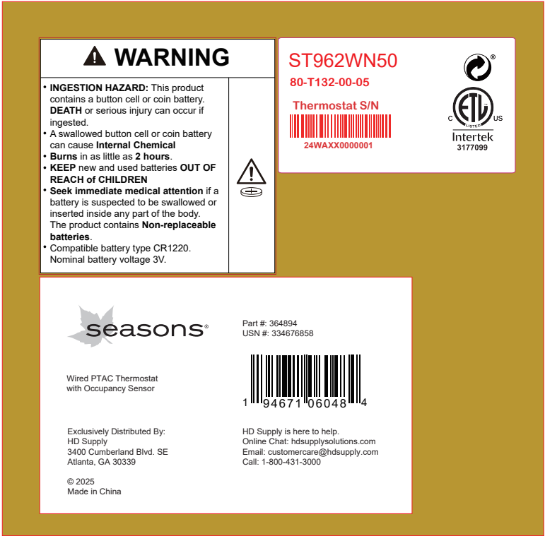
BOX label location