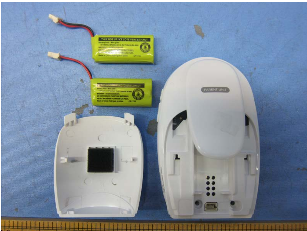
Figure 2 - Back View