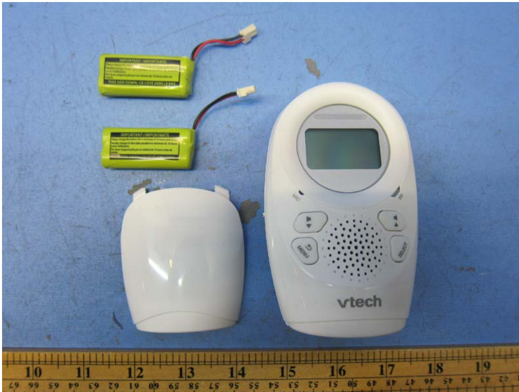
Figure 1 - Front View