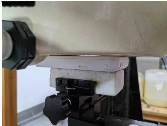
Front Face of EUT with 0 cm Gap