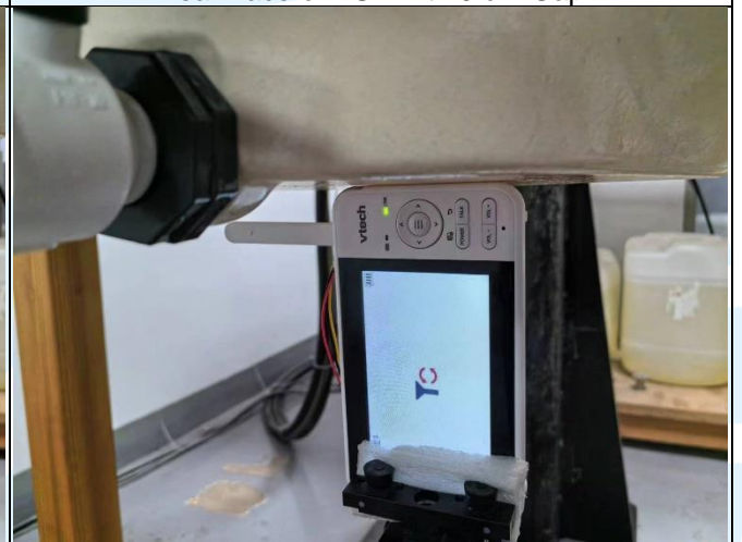
Right Side of EUT with 0 cm Gap