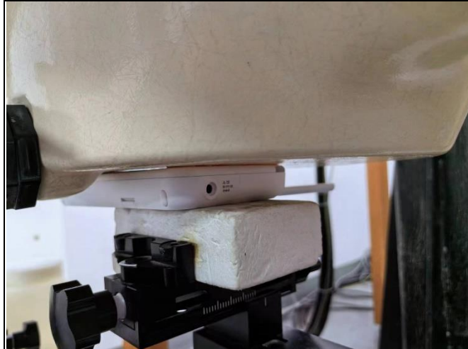
Front Face of EUT with 0 cm Gap