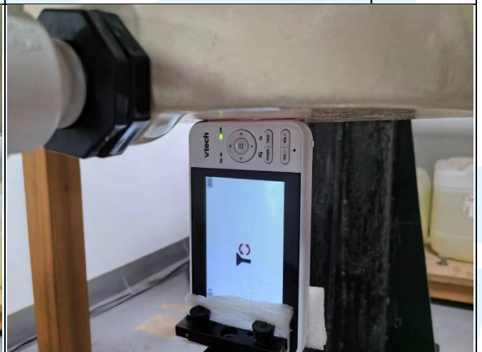
Right Side of EUT with 0 cm Gap