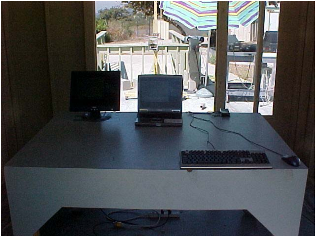
Radiated Emissions Measurement (1-26.5 GHz) (Front View) Setup