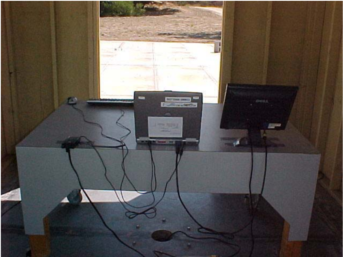
Radiated Emissions Measurement (1-26.5 GHz) (Rear View) Setup