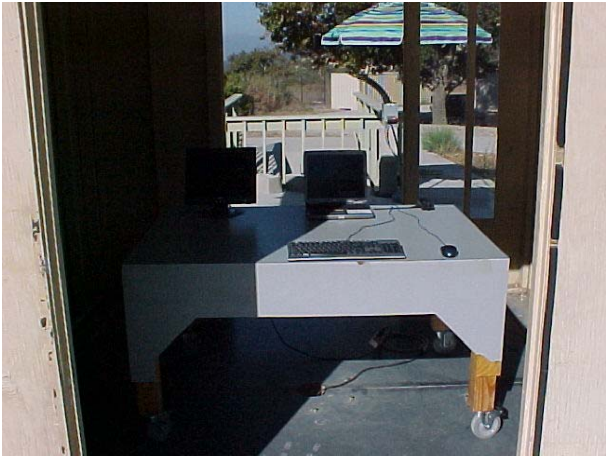
Radiated Emissions Measurement (30-1000 MHz) (Front View) Setup