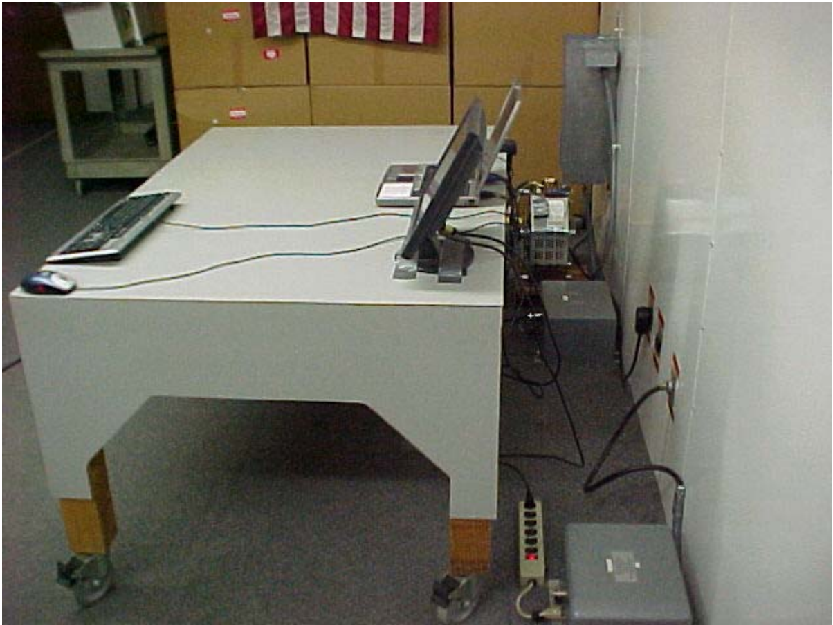
AC Conducted Emissions Measurement (Rear View) Setup