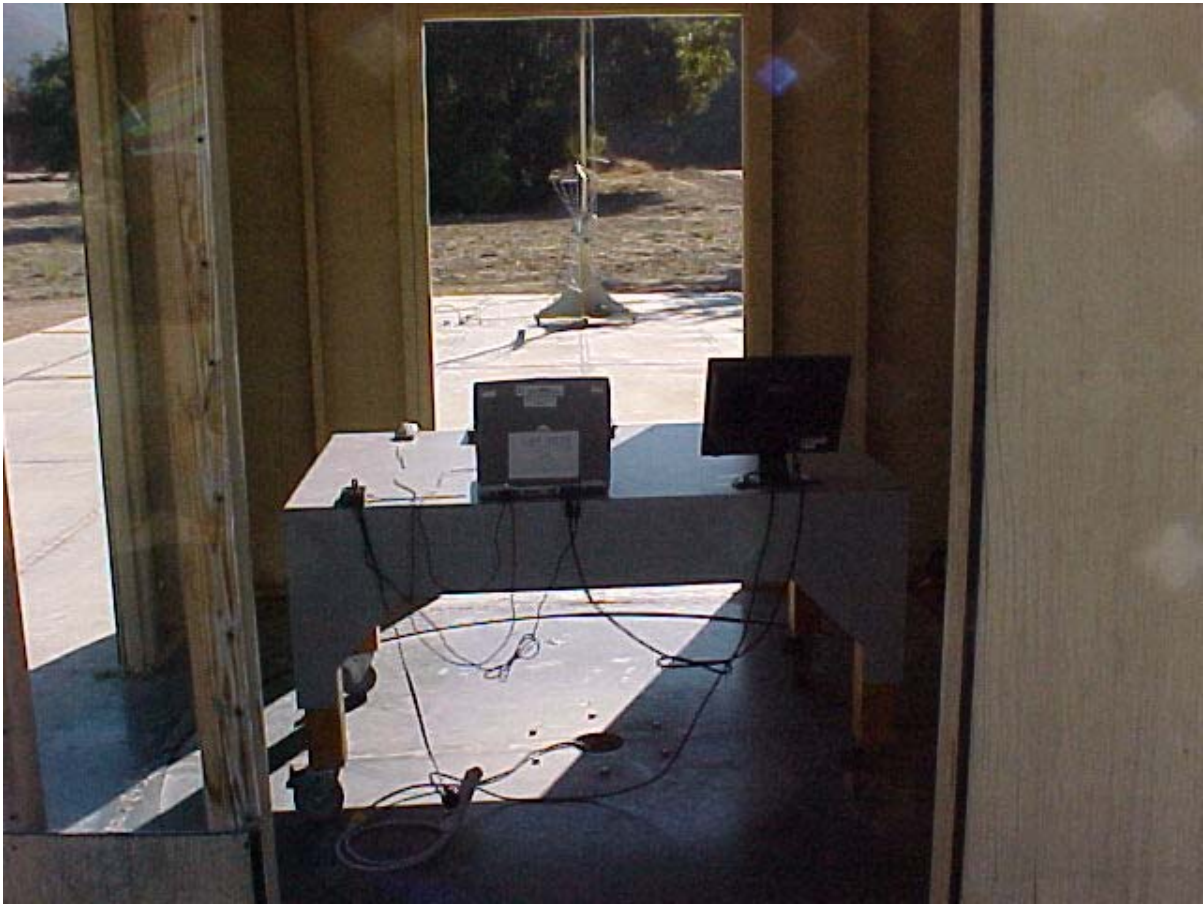
Radiated Emissions Measurement (30-1000 MHz) (Rear View) Setup