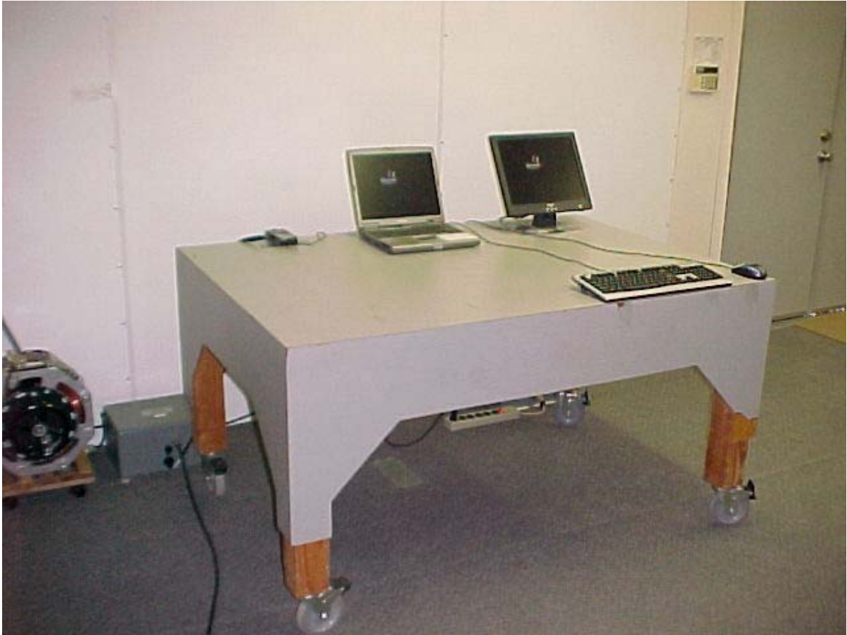
AC Conducted Emissions Measurement (Front View) Setup