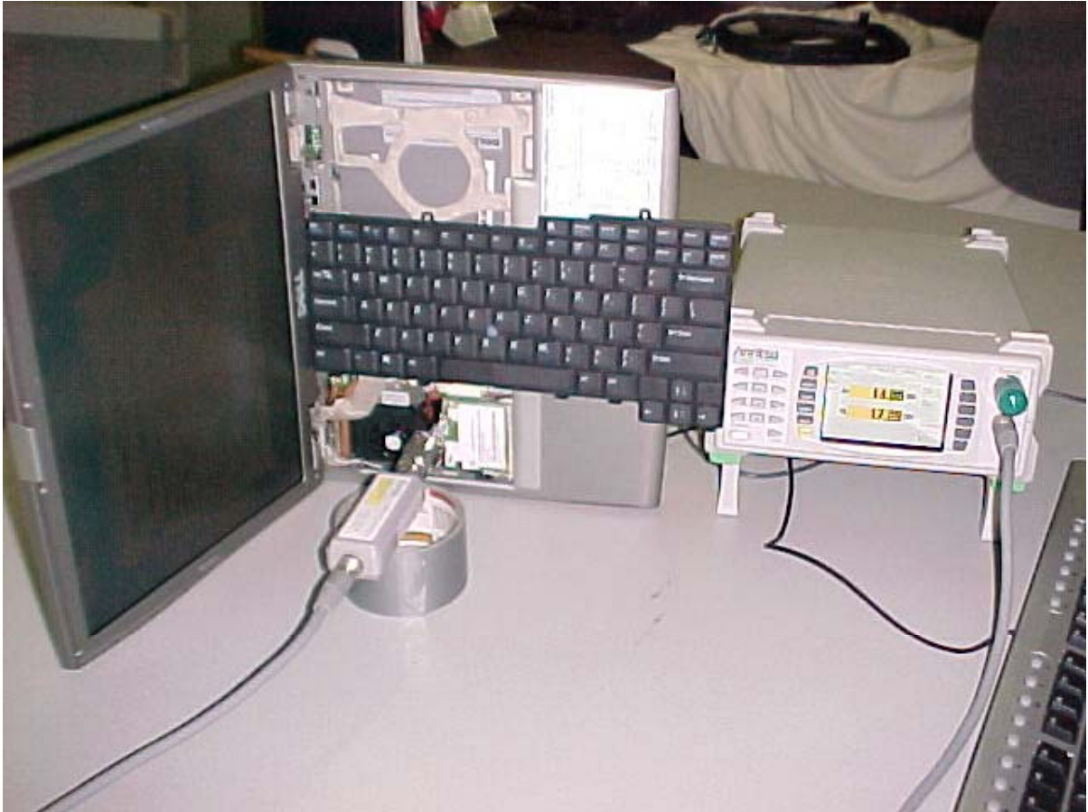
Maximum Peak Output Power Measurement Setup