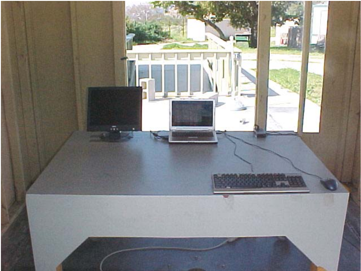
Radiated Emissions Measurement (30-1000 MHz) (Front View) Setup