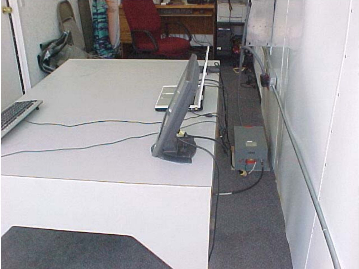
AC Conducted Emissions Measurement (Rear View) Setup