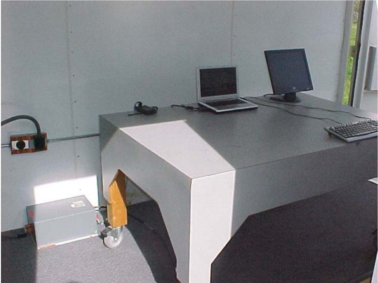
AC Conducted Emissions Measurement (Front View) Setup