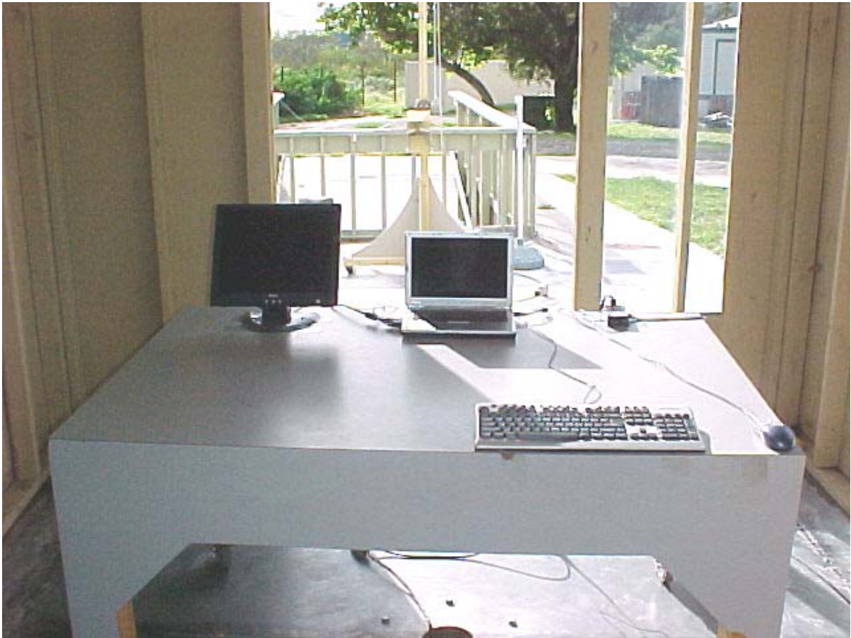
Radiated Emissions Measurement (1-26.5 GHz) (Front View) Setup