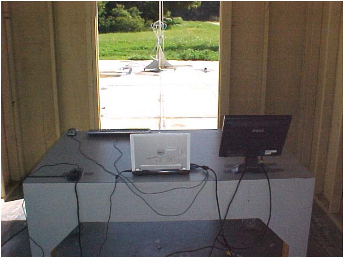
Radiated Emissions Measurement (30-1000 MHz) (Rear View) Setup