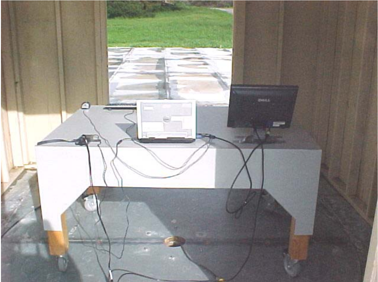
Radiated Emissions Measurement (1-26.5 GHz) (Rear View) Setup