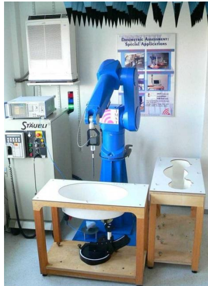
Fig. 3: The measurement set-up with a DASY system and phantoms containing tissue simulating liquid.

The EUT operating at the maximum power level is placed by a non-metallic device holder (delivered from Schmid & Partner) in the above described positions at a shell phantom of a human being. The distribution of the electric field strength E is measured in the tissue simulating liquid within the shell phantom. For this miniaturised field probes with high sensitivity and low field disturbance are used. Afterwards the corresponding SAR values are calculated with the known electrical conductivity \sigma and the mass density \rho of the tissue in the SEMCAD FDTD software. The software is able to determine the averaged SAR values (averaging region 1 g or 10 g) for compliance testing.