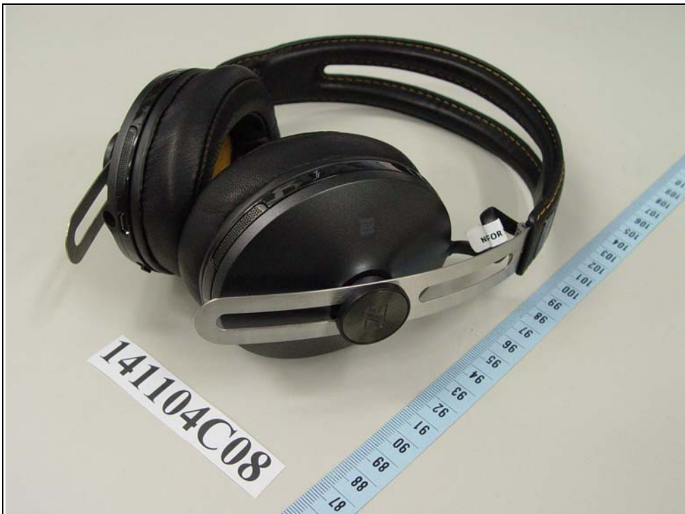
Model: M2 AEBT

The minimum test separation distance is determined by the smallest distance from the antenna and radiating structures or outer surface of the device, according to the host form factor, exposure conditions and platform requirements, to any part of the body or extremity of a user or bystander. (See below figure)