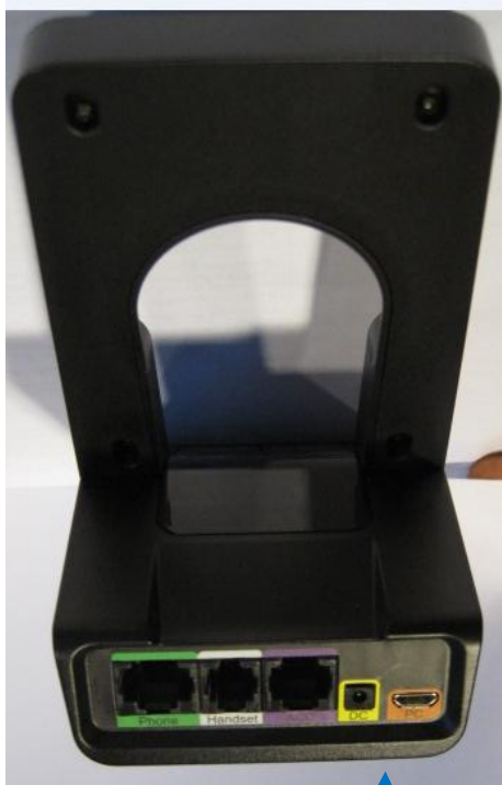
Figure 1.1: SD BS-US (view from back )