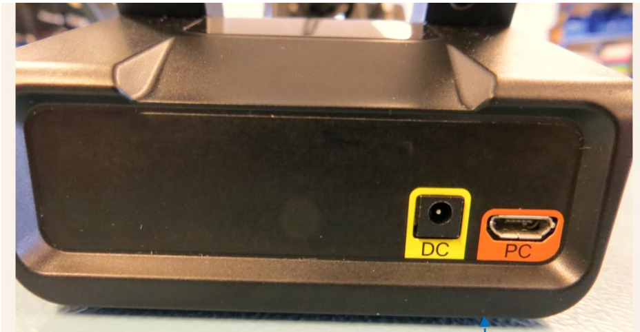
Figure 1.1: SD BS USB -US (view from back)