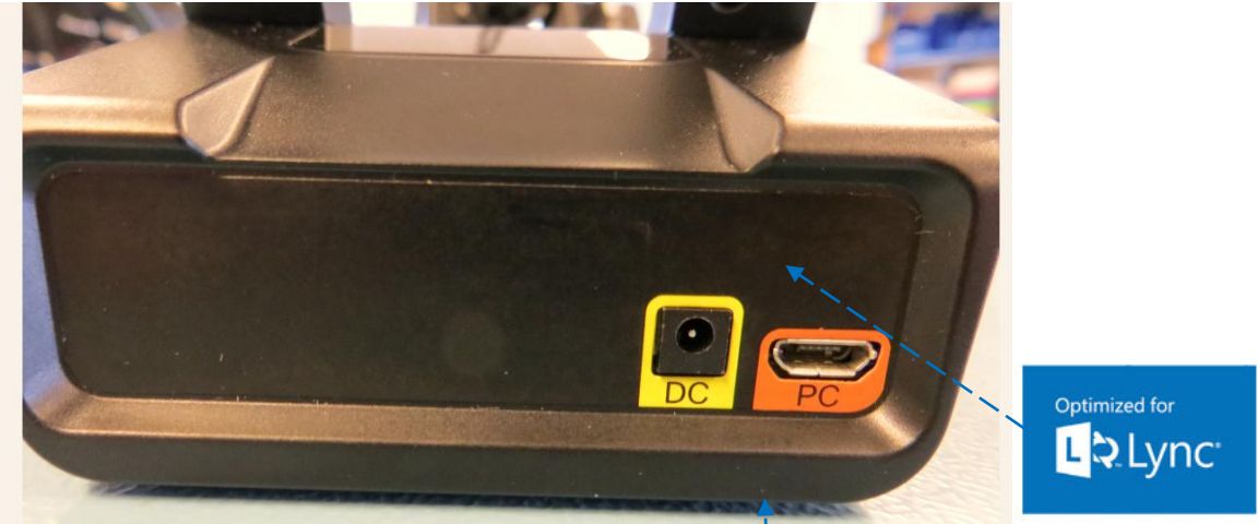
Figure 1.1: SD BS USB ML -US (view from back)