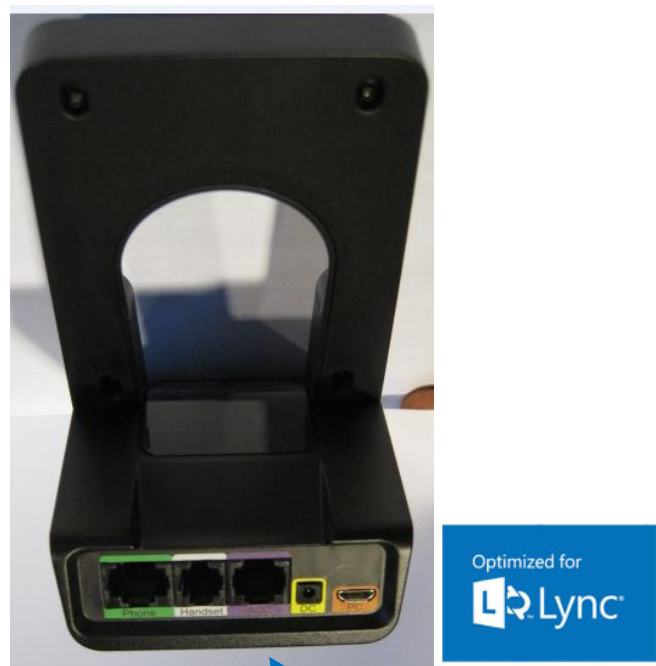
Figure 1.1: SD BS ML -US (view from back)