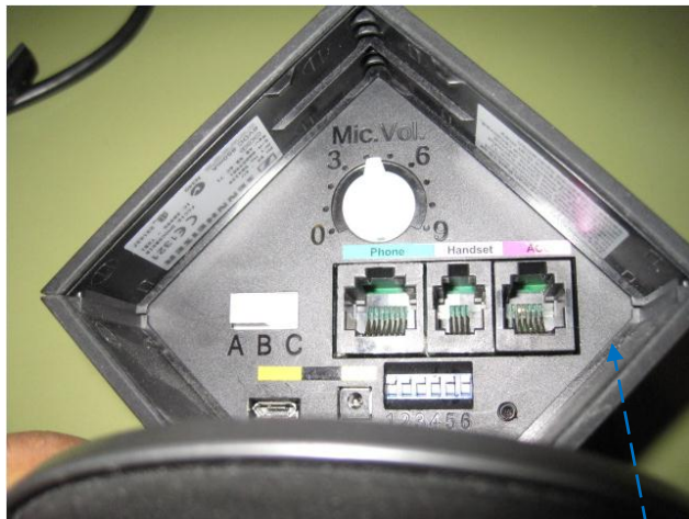
Figure 1.1: Position of the label /Back view of the DW BS -US