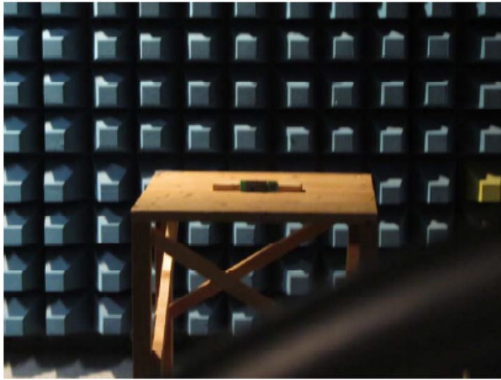
Test setup for radiated emission measurement (fully anechoic room)