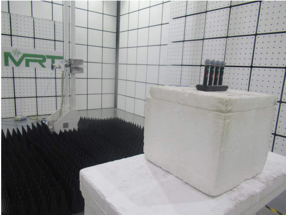
Description: RF Conducted Test Setup – MXWNDX4