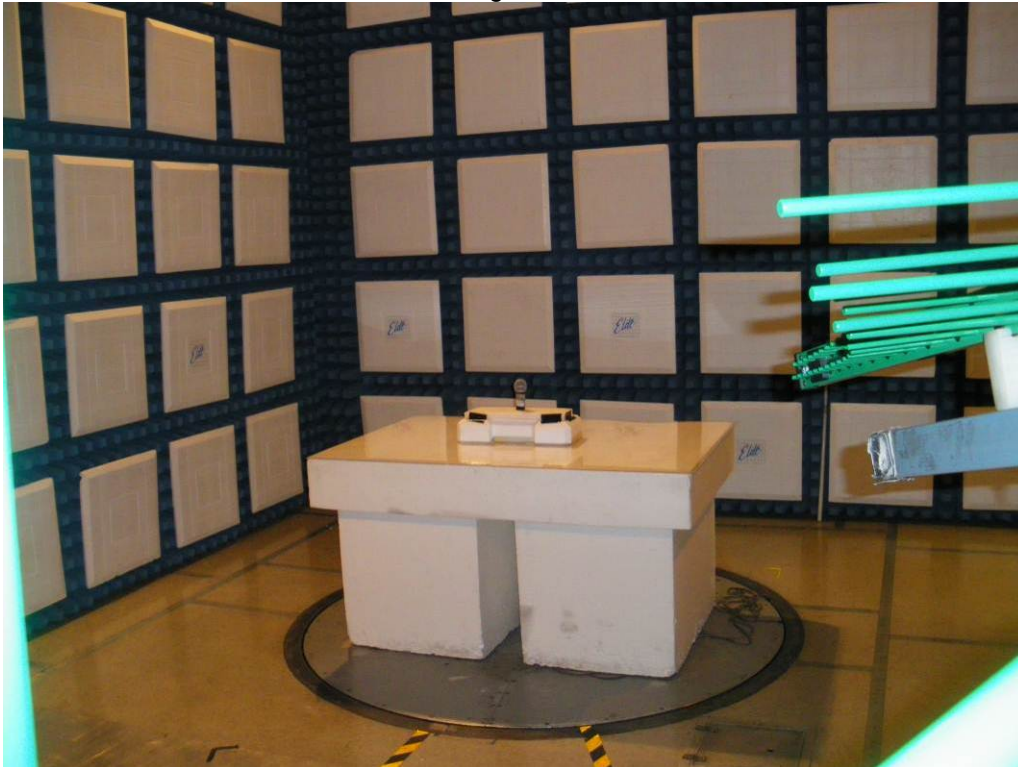
Test Setup for Radiated Emissions, 30MHz to 1GHz – Horizontal Polarization