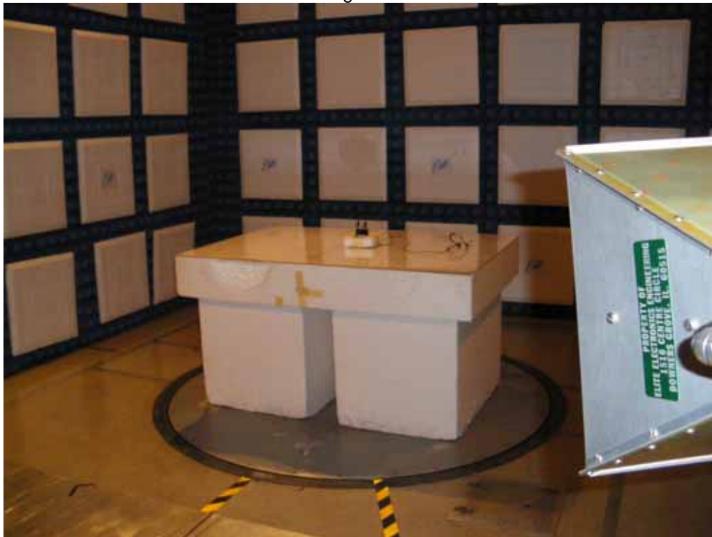
Test Set-up for Radiated Emissions, Above 1GHz – Horizontal Polarization