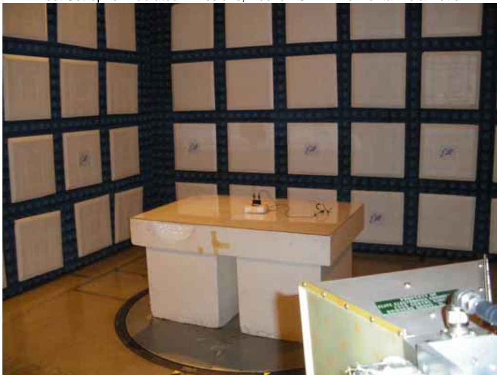
Test Set-up for Radiated Emissions, Above 1GHz – Vertical Polarization