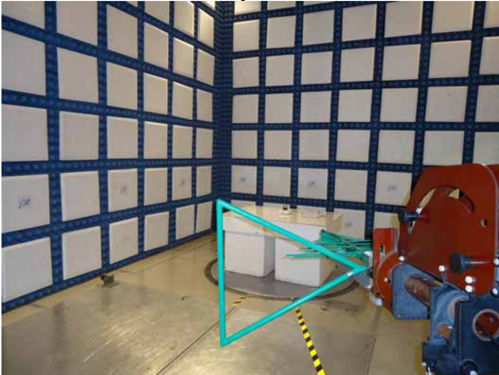
Test Set-up for Radiated Emissions, 30MHz to 1GHz – Horizontal Polarization