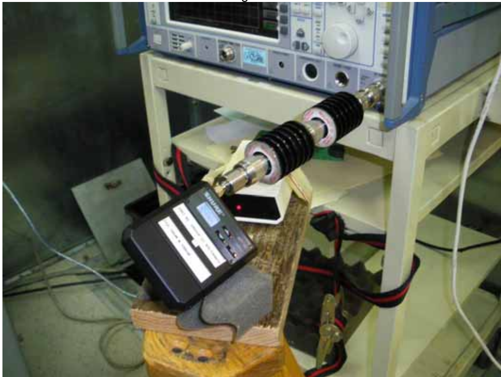
Test Set-up for RF Power Output Test