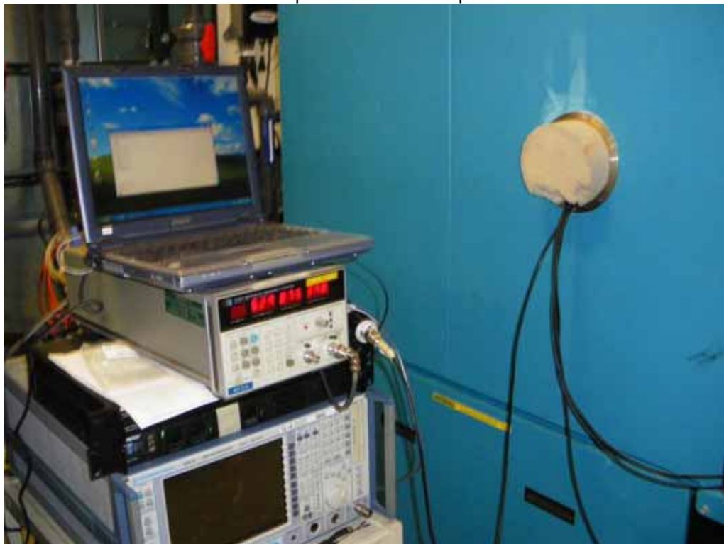
Test Set-up for Frequency Stability Test