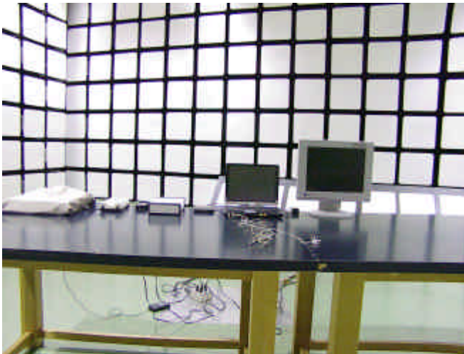
Figure 6, Front View