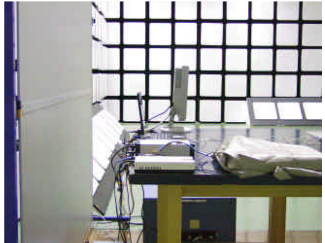
Figure 5, Rear View