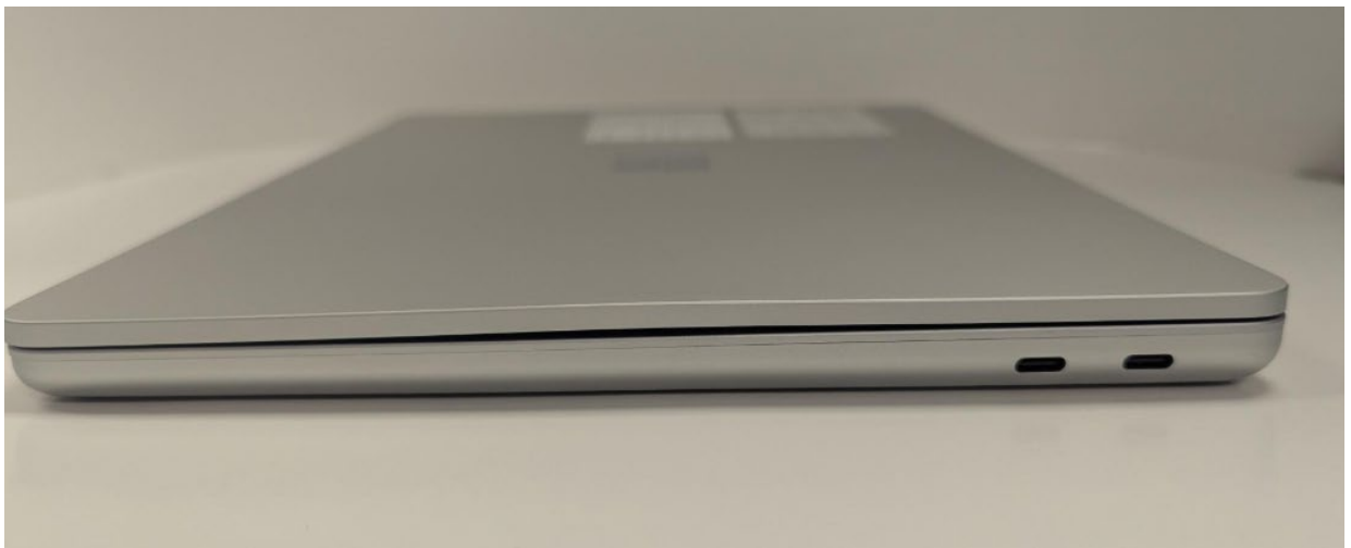
Figure 2: Right Edge