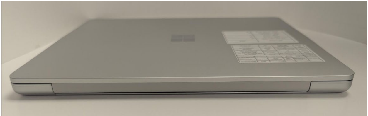
Figure 4: Rear Edge (Hinge)