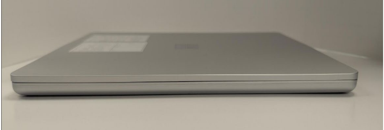
Figure 3: Front Edge