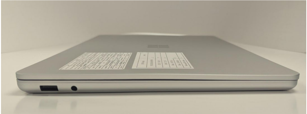
Figure 1: Left Edge