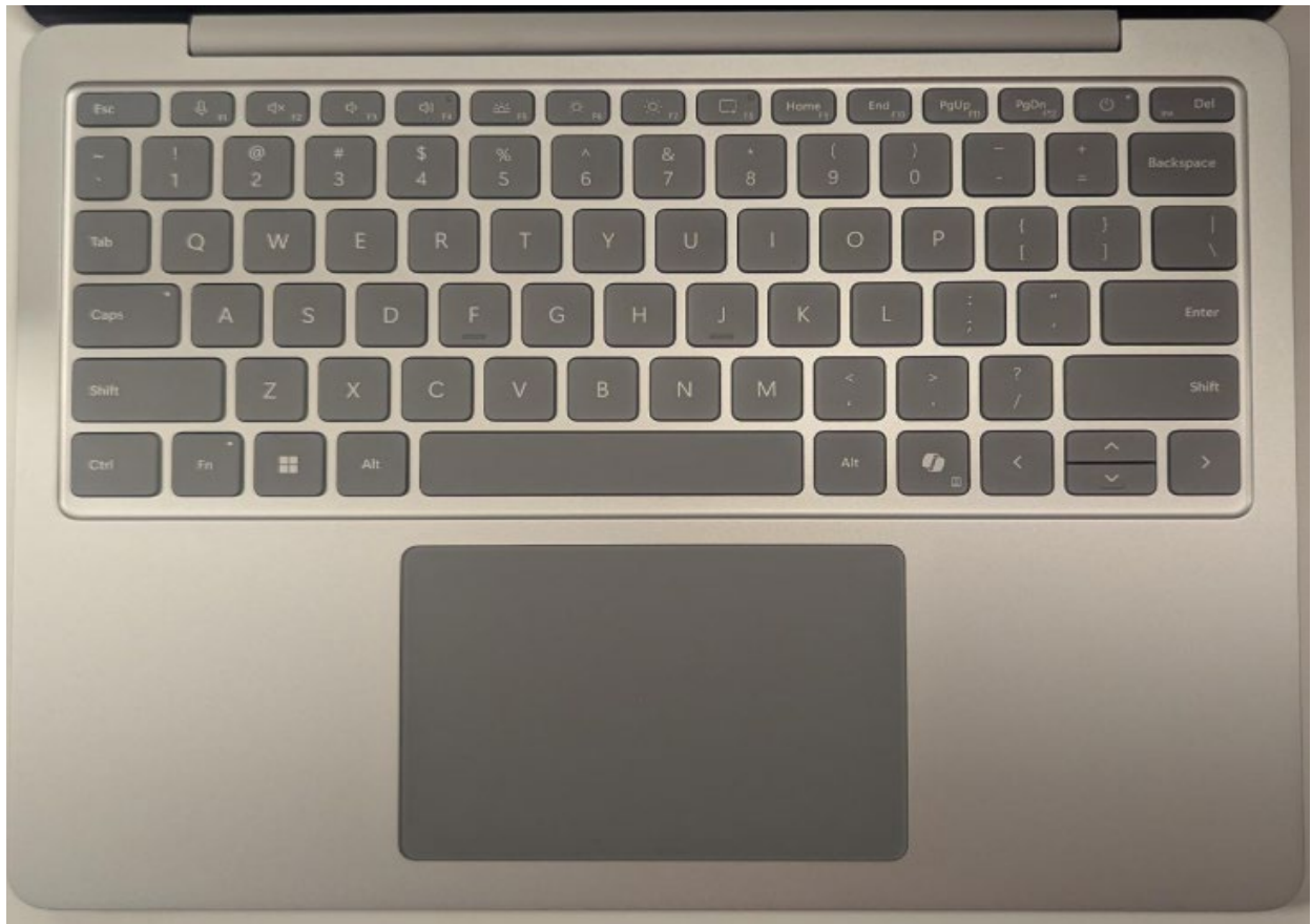
Figure 7: Keyboard (with Device open)