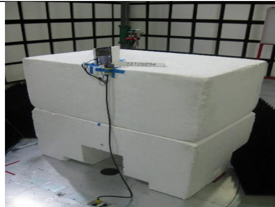
Y-AXIS BACK PHOTO (Above 1GHz Bands)