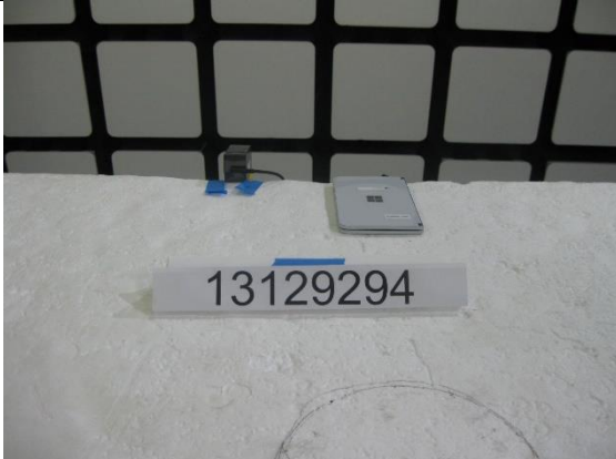
X-AXIS FRONT PHOTO (Below 1GHz Bands)