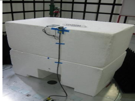
X-AXIS BACK PHOTO (Below 1GHz Bands)