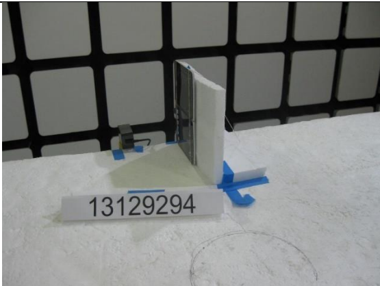
Y-AXIS FRONT PHOTO (Above 1GHz Bands)