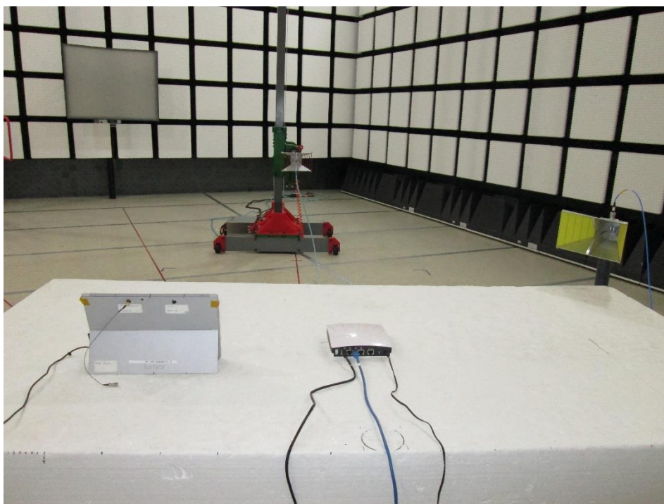
Figure 1-2 Radiated Test Setup