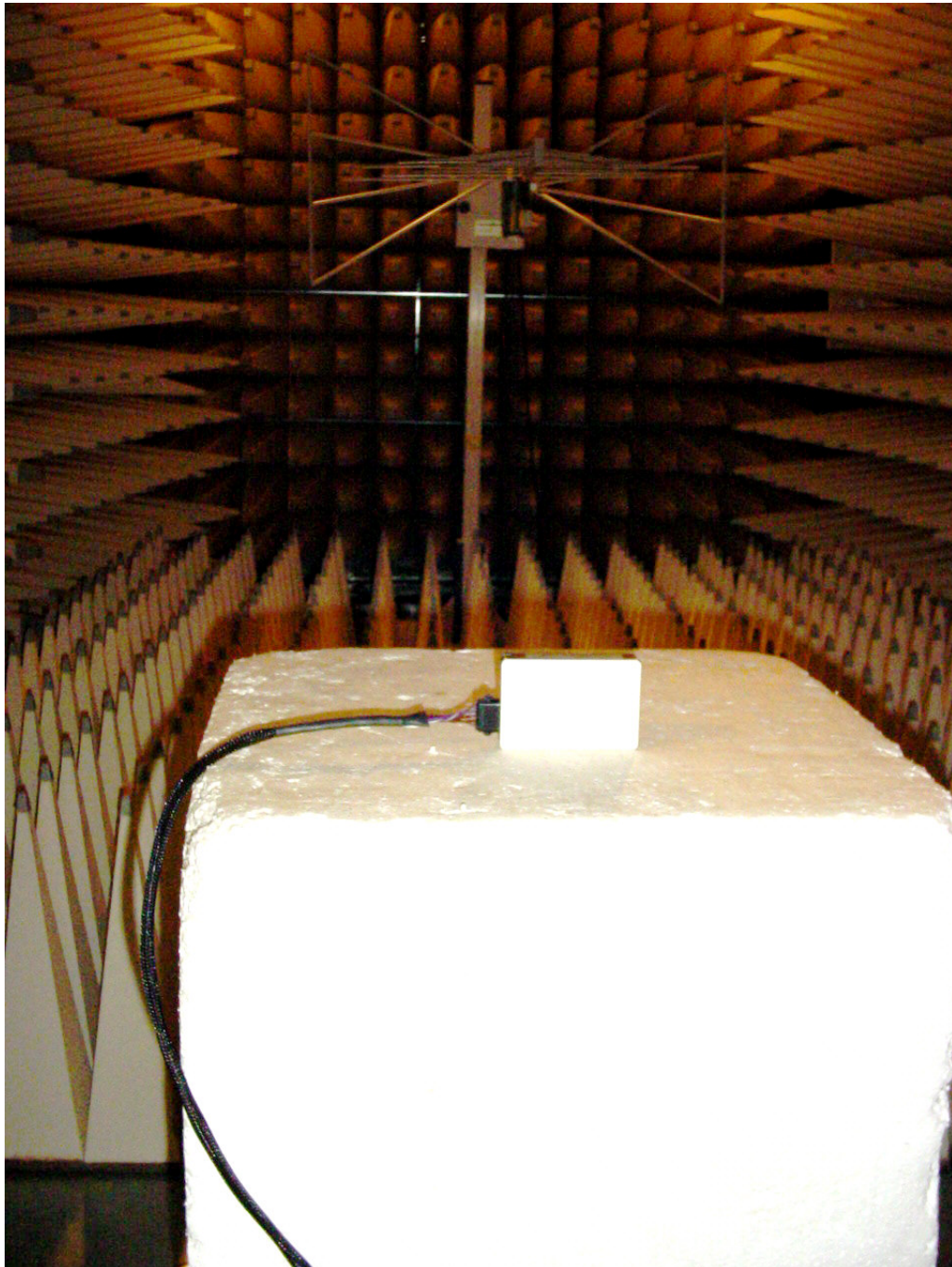
Photograph 1: Radiated Emissions Prescan up to 1 GHz