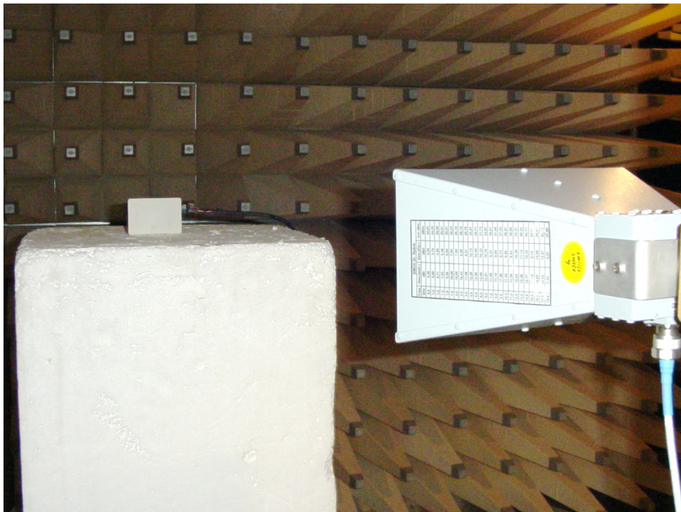
Photograph 2: Radiated Emissions Test up to 12 GHz