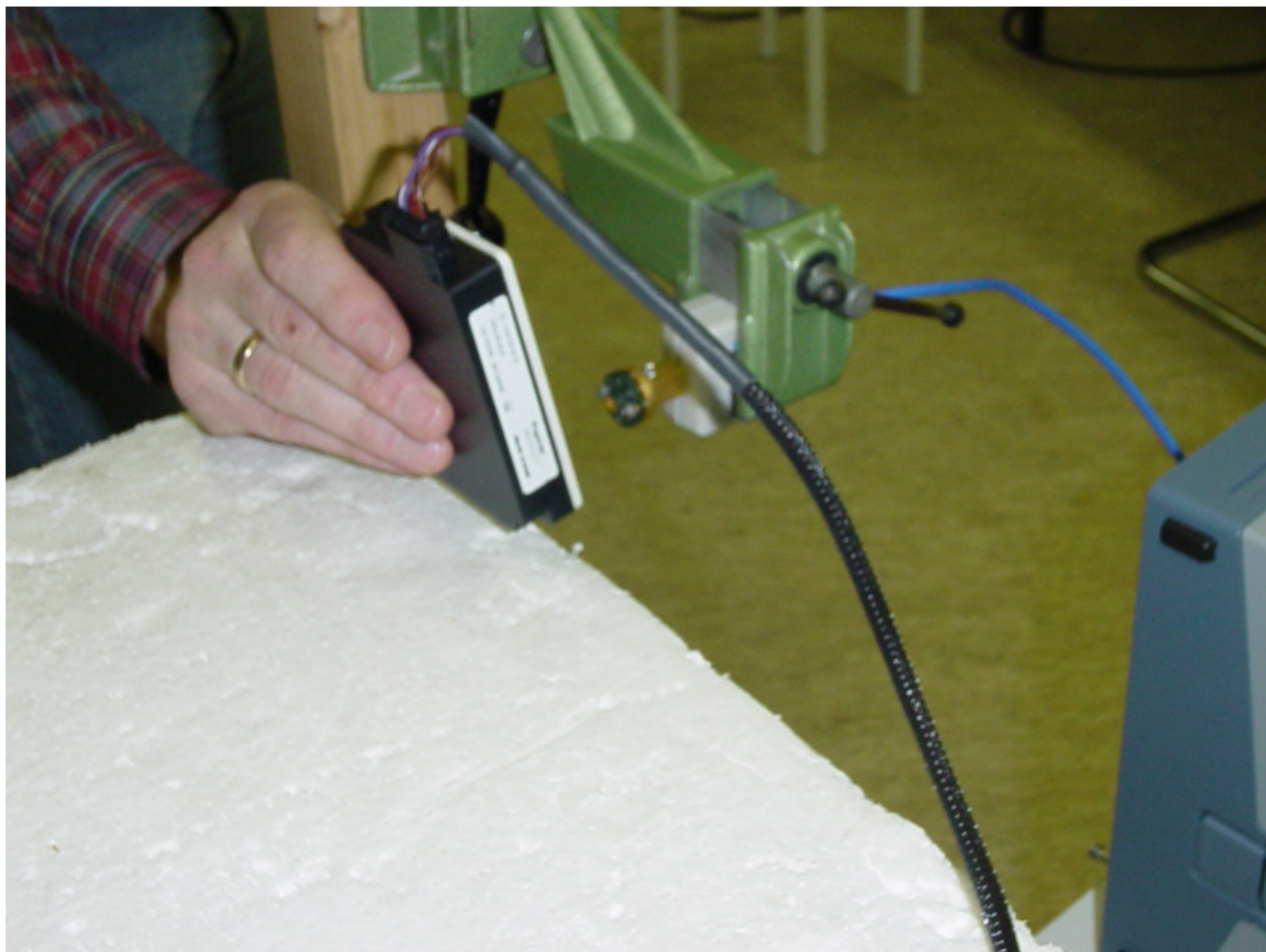
Photograph 4: Radiated Emissions Tests; Close-up Test