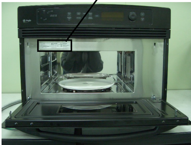
< Fig. 2. Photo of the physical location of the label>

* Alternate location: The nameplate may be alternatively affixed on the left side of control panel or internal surface of oven cavity or rear surface of oven.