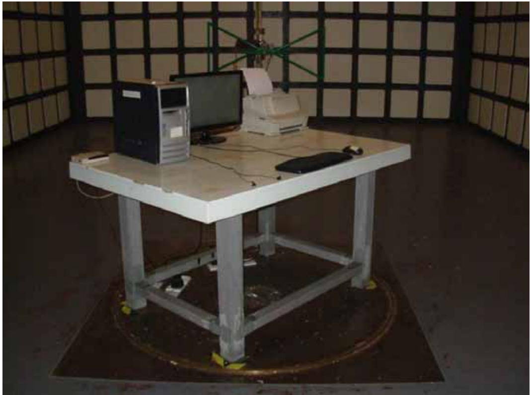
SETUP WITH MAXIMUM DETECTED EMISSION AT HORIZONTAL POLARIZATION (HDMI 1920*1080@60Hz)