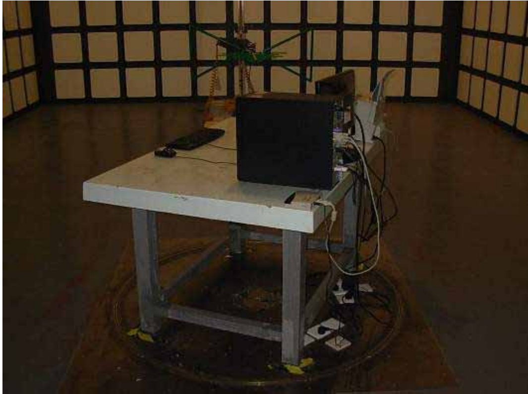
SETUP WITH MAXIMUM DETECTED EMISSION AT HORIZONTAL POLARIZATION (D-SUB 1920*1080@60Hz)