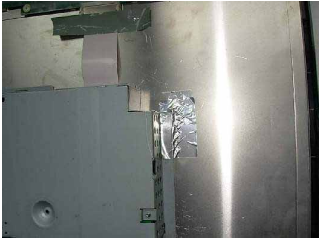
FIGURE 16 LCD MONITOR (M/N: W2243TV) DEBUG #2