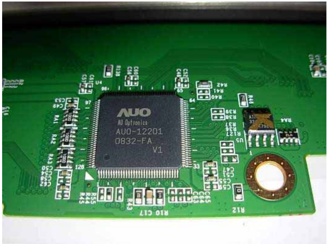
FIGURE 14 LCD MONITOR (M/N: W2243TV) LABEL ON LCD PANEL MAIN BOARD