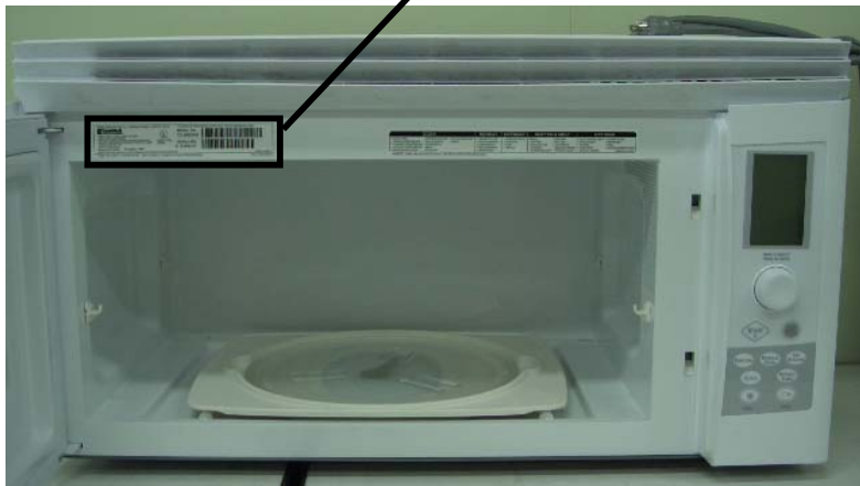
< Fig. 2. Photo of the physical location of the label>

* Alternate location: The nameplate may be alternatively affixed on the left side of control panel or internal surface of oven cavity or rear surface of oven.