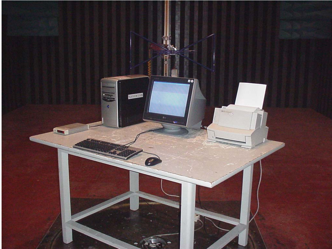
SETUP WITH MAXIMUM DETECTED EMISSION AT HORIZONTAL POLARIZATION (800*600@60Hz)