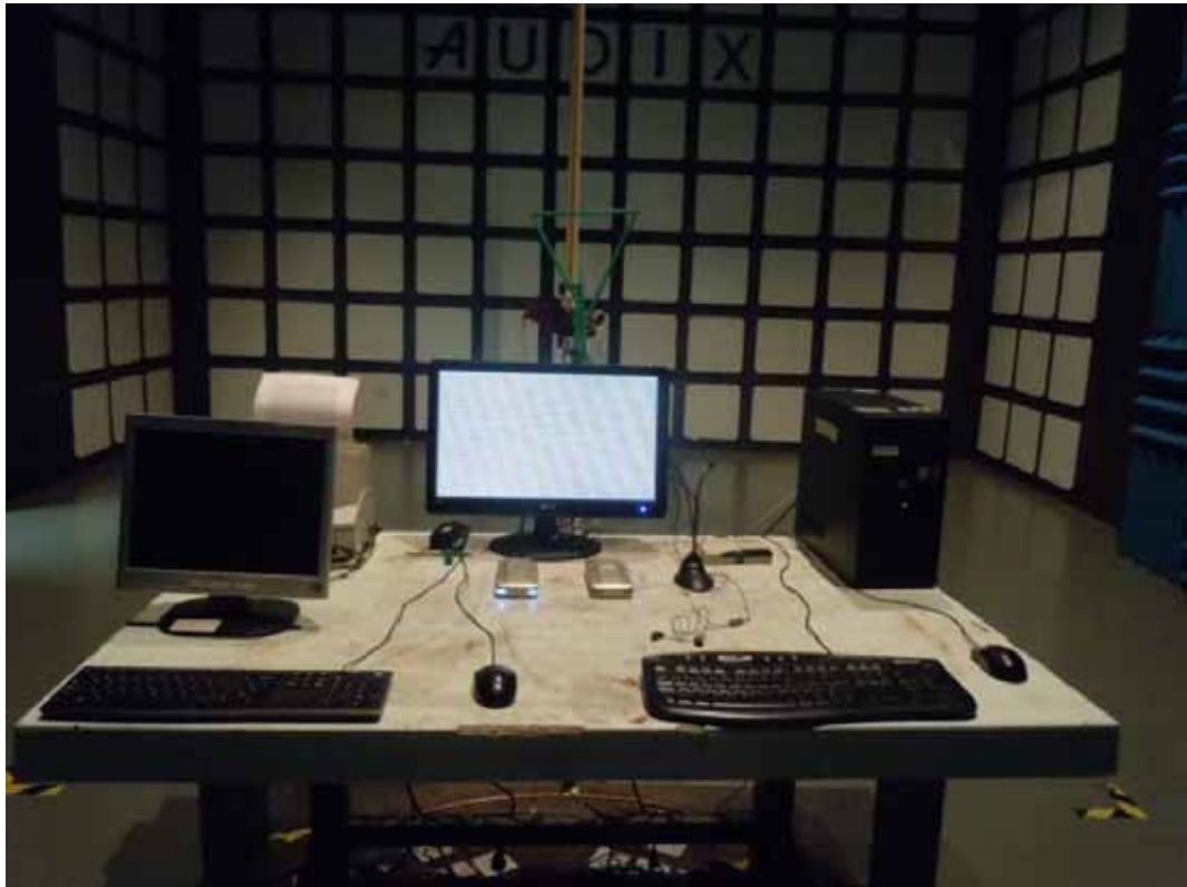
FRONT VIEW OF RADIATED EMISSION TEST (BELOW 1GHZ)