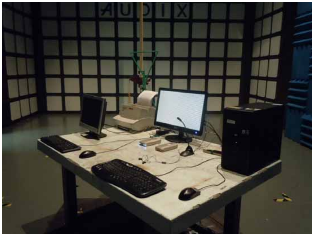
SETUP WITH MAXIMUM DETECTED EMISSION AT VERTICAL POLARIZATION (TEST MODE: D-SUB 1920*1080@60Hz)