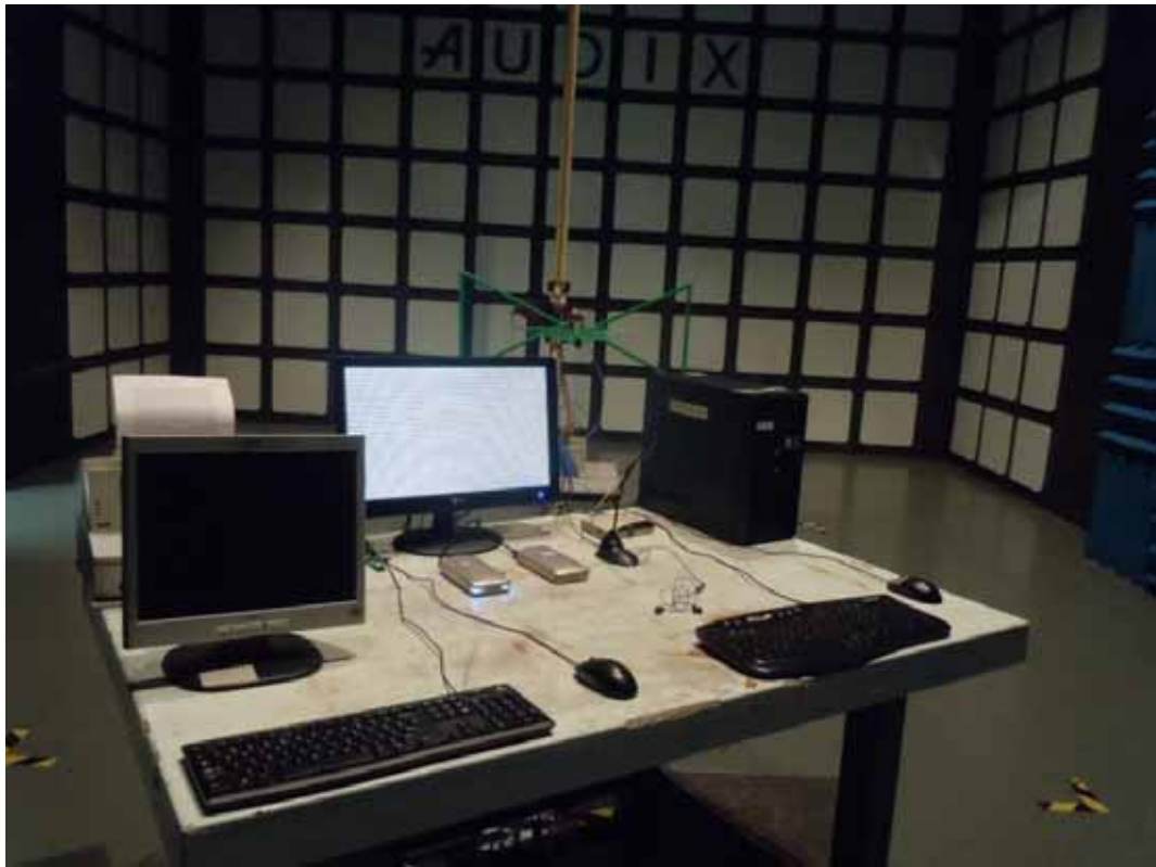
SETUP WITH MAXIMUM DETECTED EMISSION AT HORIZONTAL POLARIZATION (TEST MODE: D-SUB 1920*1080@60Hz)