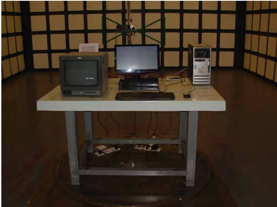
FRONT VIEW OF RADIATED EMISSION TEST