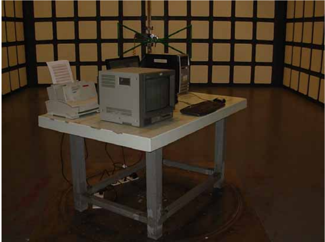
SETUP WITH MAXIMUM DETECTED EMISSION AT HORIZONTAL POLARIZATION (TEST MODE: HDMI 480P)