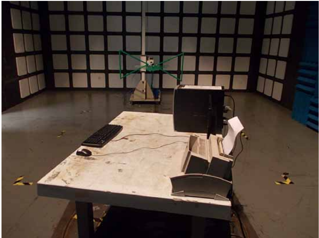
SETUP WITH MAXIMUM DETECTED EMISSION AT HORIZONTAL POLARIZATION (TEST MODE: D-SUB 640*480@60Hz)