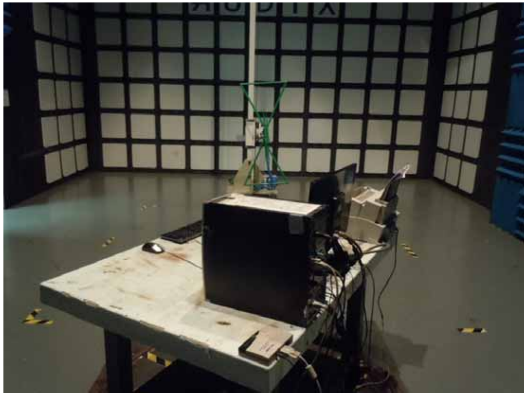
SETUP WITH MAXIMUM DETECTED EMISSION AT VERTICAL POLARIZATION (TEST MODE: HDMI 1920*1080@60Hz Adapter #1)