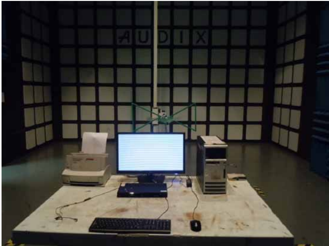
FRONT VIEW OF RADIATED EMISSION TEST (BELOW 1GHZ)