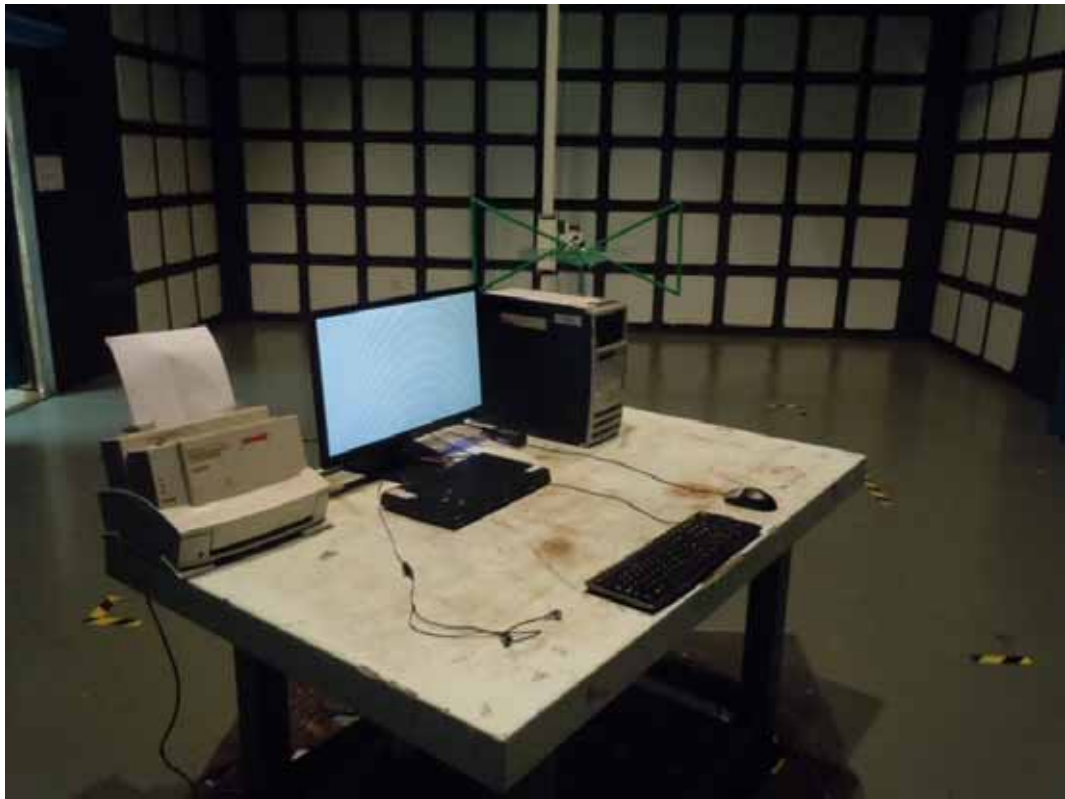
SETUP WITH MAXIMUM DETECTED EMISSION AT HORIZONTAL POLARIZATION (TEST MODE: HDMI 1920*1080@60Hz Adapter #1)