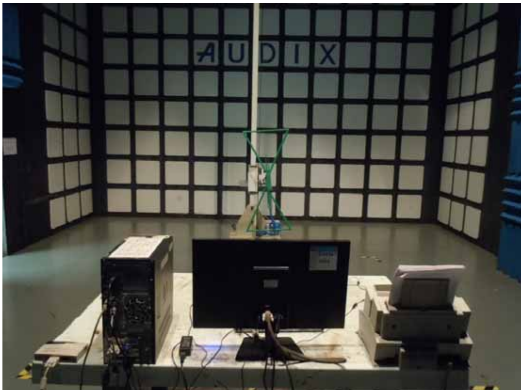
BACK VIEW OF RADIATED EMISSION TEST (BELOW 1GHZ)