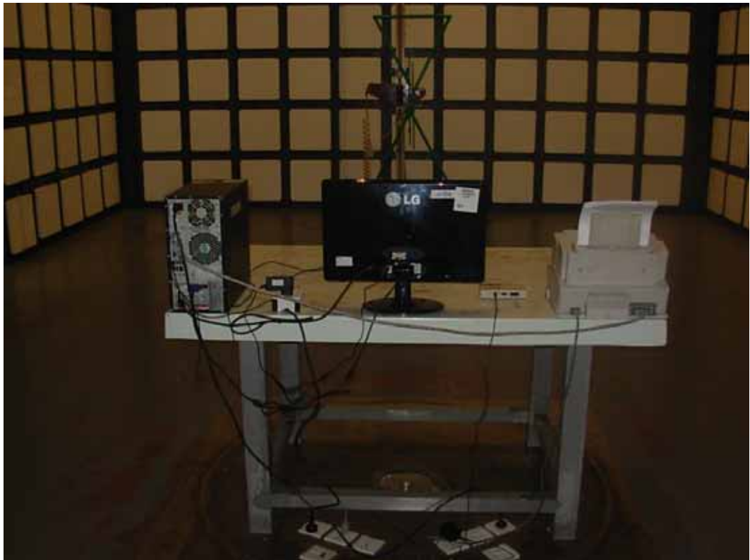
BACK VIEW OF RADIATED EMISSION TEST