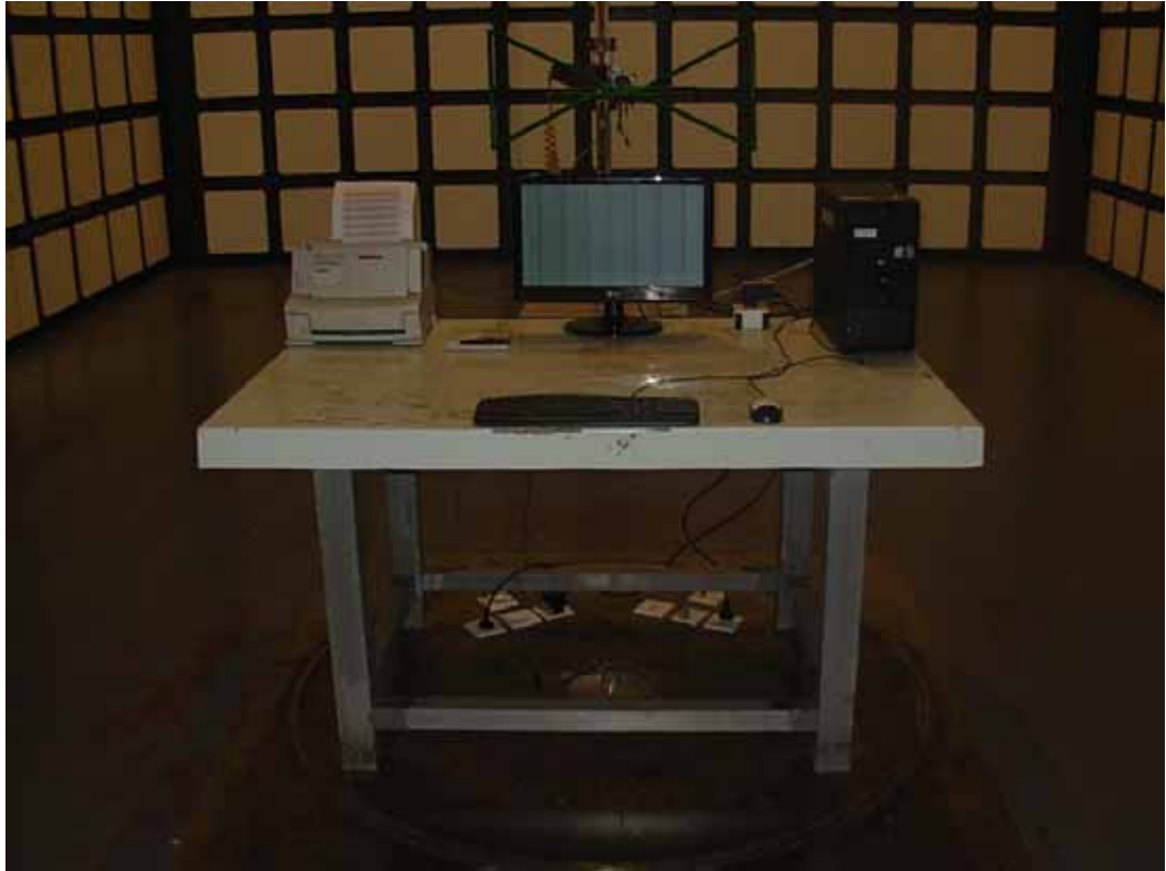
FRONT VIEW OF RADIATED EMISSION TEST