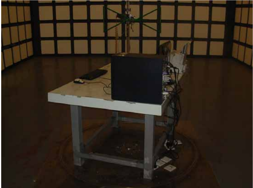
SETUP WITH MAXIMUM DETECTED EMISSION AT HORIZONTAL POLARIZATION (TEST MODE: DVI 1600*900@60Hz) (ADAPTER: DSA-36W-12 1 24)