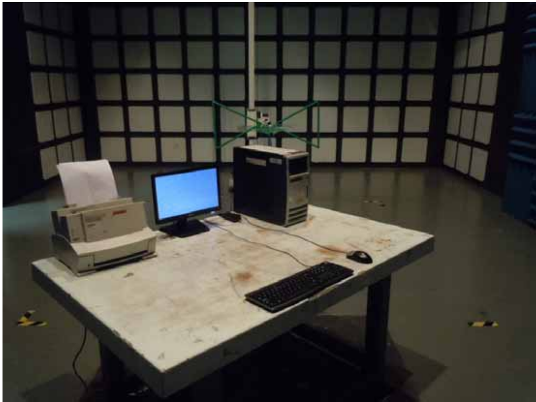
SETUP WITH MAXIMUM DETECTED EMISSION AT HORIZONTAL POLARIZATION (TEST MODE: D-SUB 1366*768@60Hz ADAPTER #2)