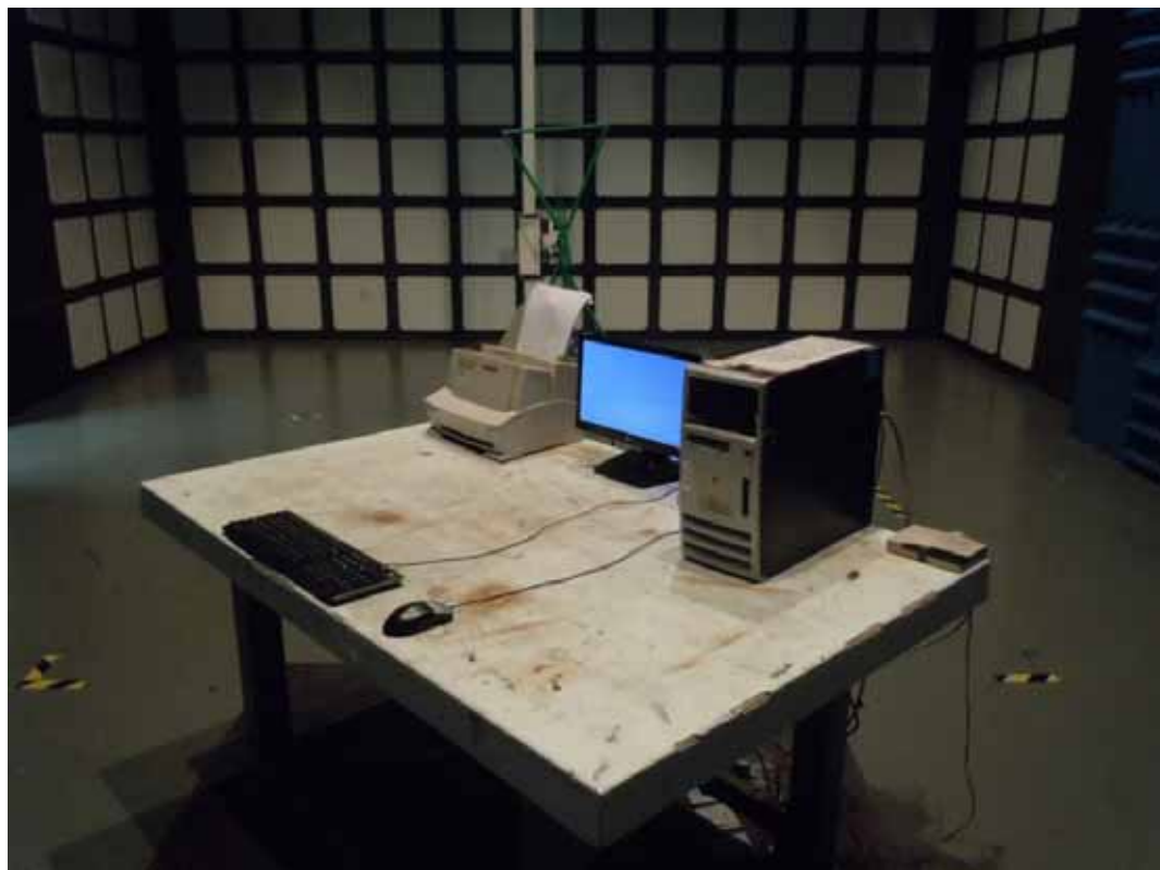
SETUP WITH MAXIMUM DETECTED EMISSION AT VERTICAL POLARIZATION (TEST MODE: D-SUB 1366*768@60Hz ADAPTER #2)