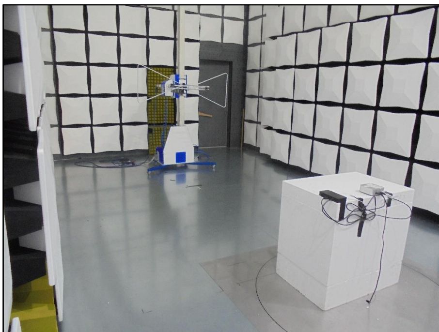
Figure 2 - Radiated Disturbance - Below 1 GHz