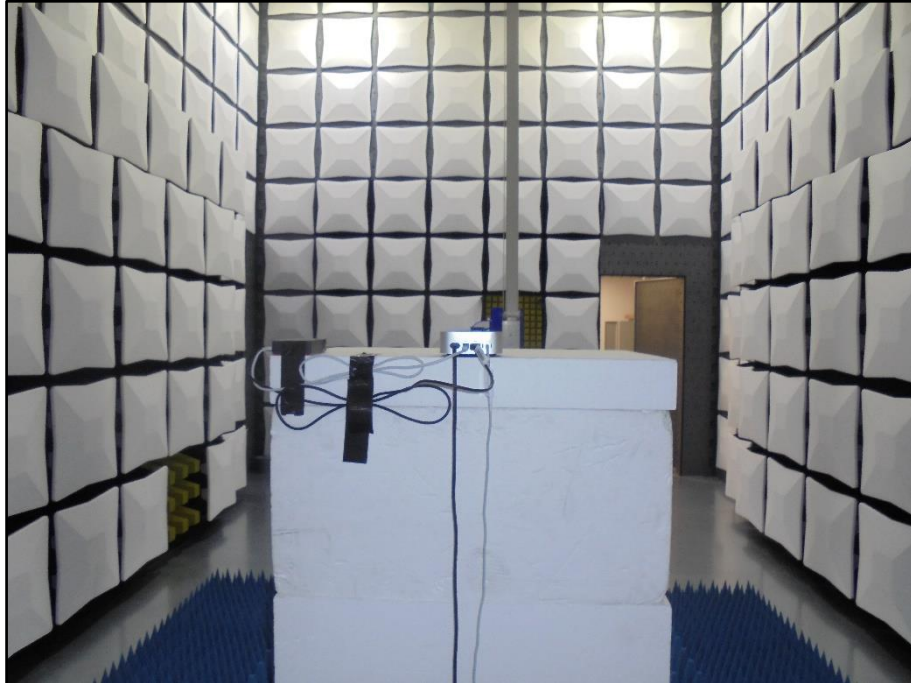
Figure 3 - Radiated Disturbance - Above 1 GHz