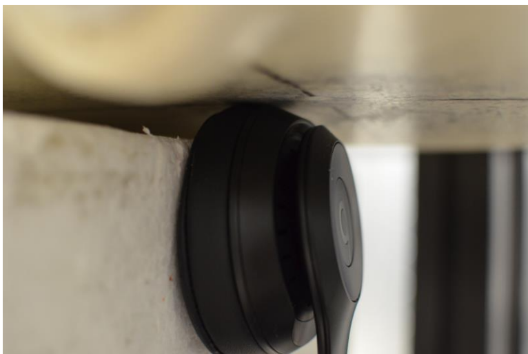
SAR Test Setup Photo 3: Bottom Edge Extremity SAR at 0.0 cm