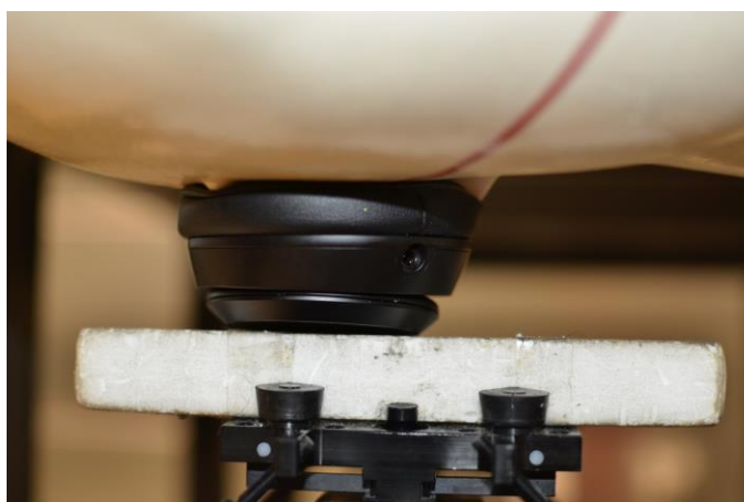
SAR Test Setup Photo 2: Right Head SAR Cushion Side at 0.0 cm