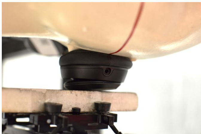
SAR Test Setup Photo 1: Left Head SAR Cushion Side at 0.0 cm