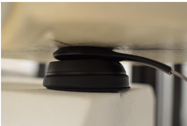
SAR Test Setup Photo 4: Logo Extremity SAR at 0.0 cm