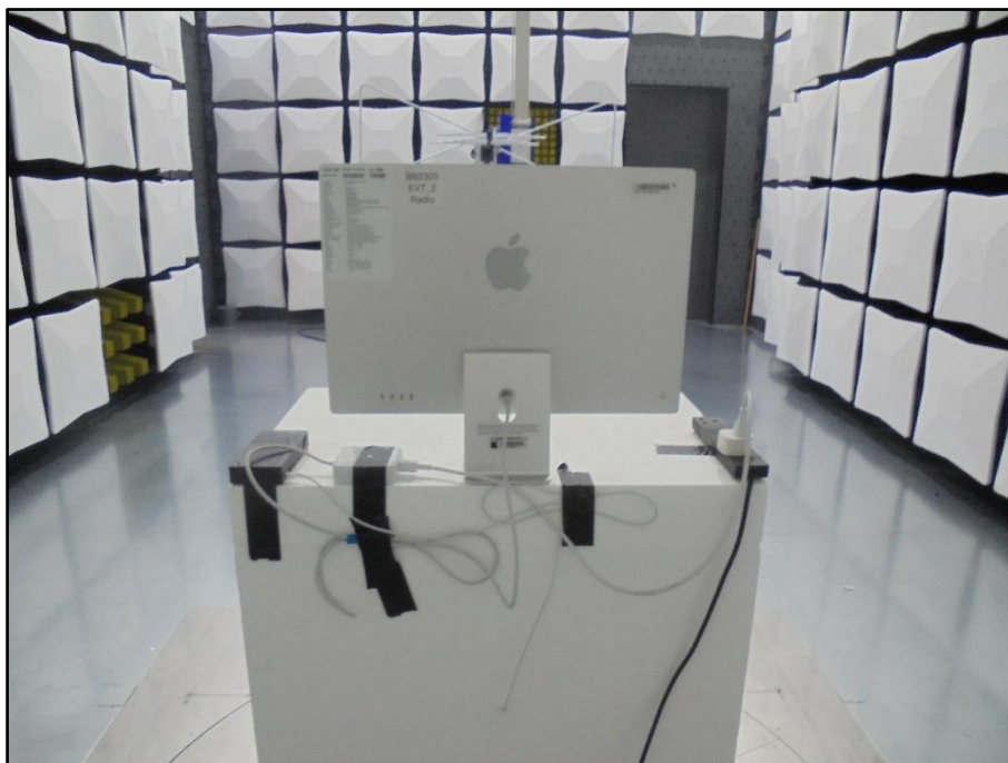
Figure 1 - Radiated Disturbance - Below 1 GHz