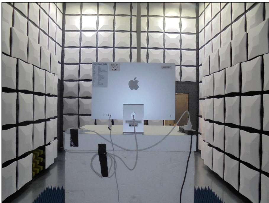
Figure 3 - Radiated Disturbance - Above 1 GHz