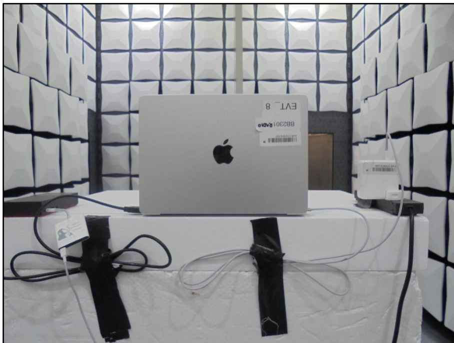
Figure 3 - Radiated Disturbance - Above 1 GHz