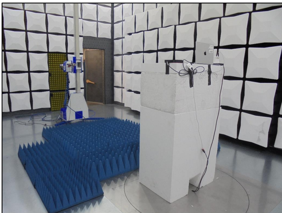
Figure 4 - Radiated Disturbance - Above 1 GHz