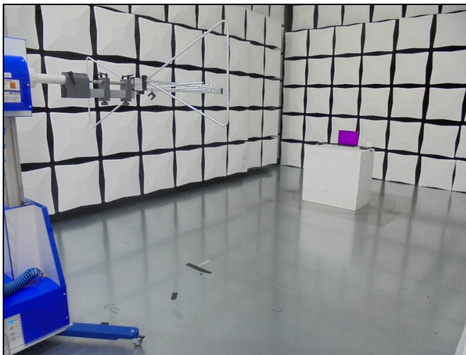
Figure 2 - Radiated Disturbance - Below 1 GHz