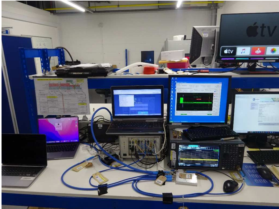
Figure 5 – Dynamic Frequency Selection