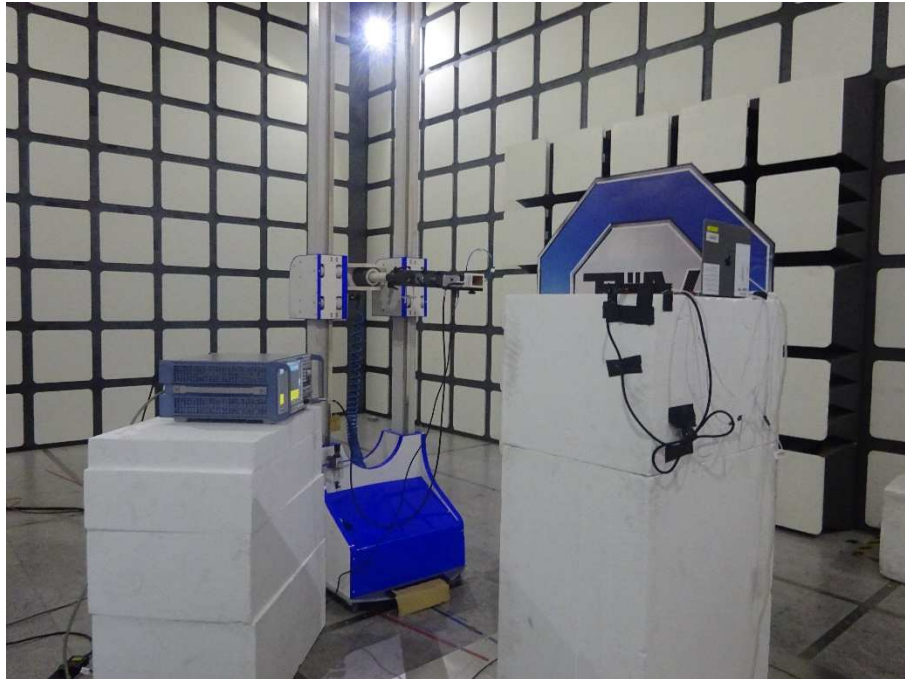
Figure 3 Radiated Disturbance - Above 1 GHz