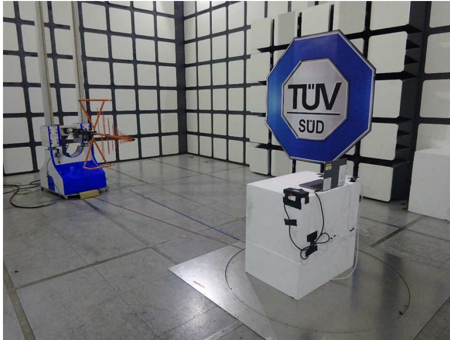
Figure 1 - Radiated Disturbance - Below 1 GHz