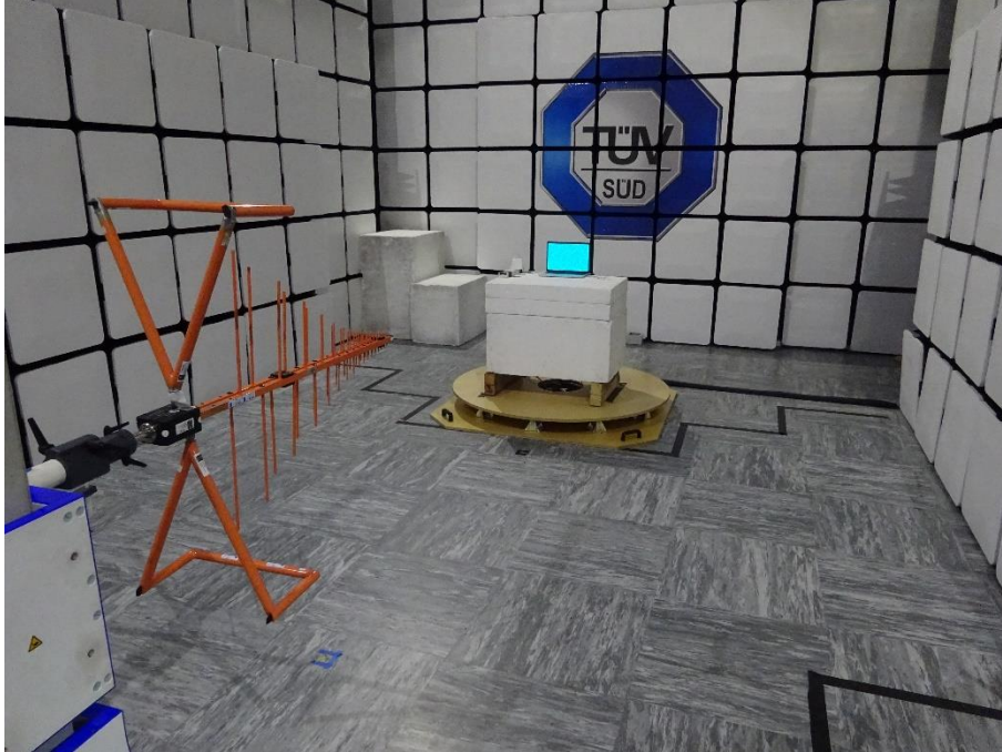
Figure 1 - Radiated Disturbance - Below 1 GHz