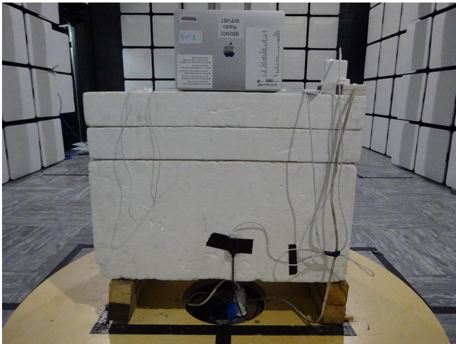
Figure 2 - Radiated Disturbance - Below 1 GHz