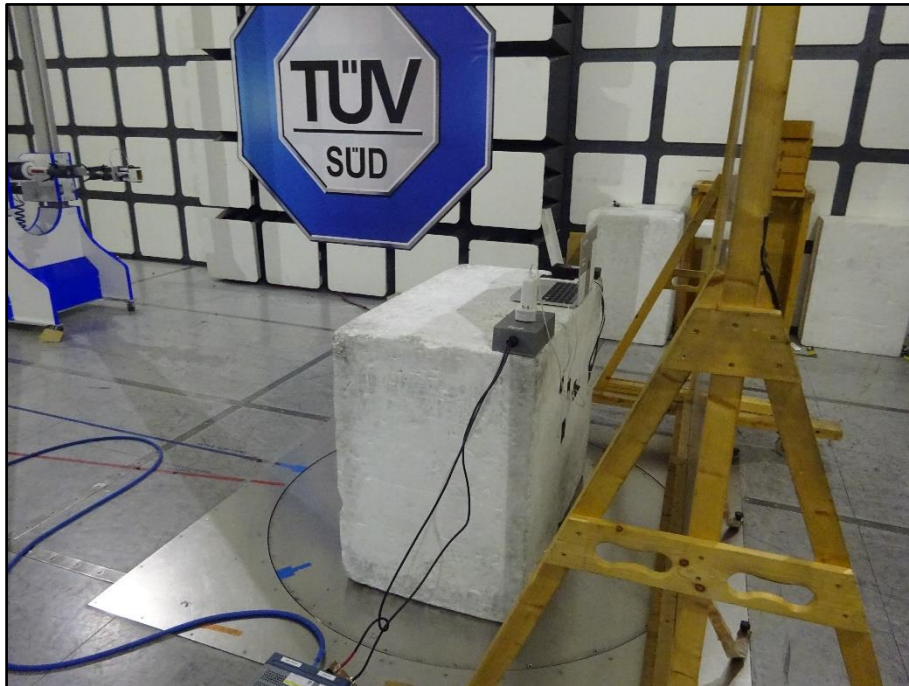
Figure 5 - Conducted Disturbance at Mains Terminals