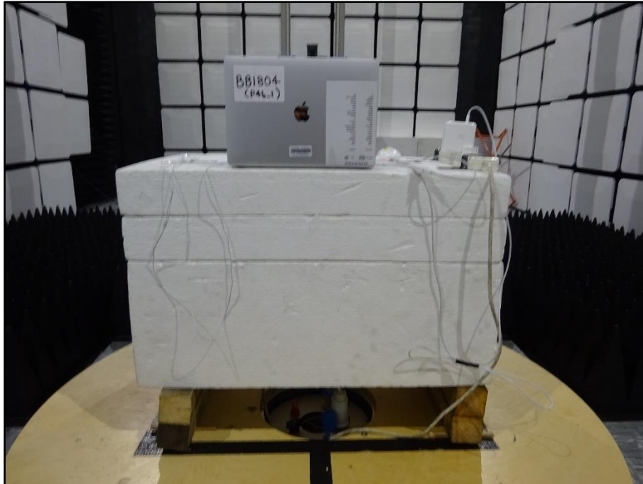
Figure 3 Radiated Disturbance - Above 1 GHz