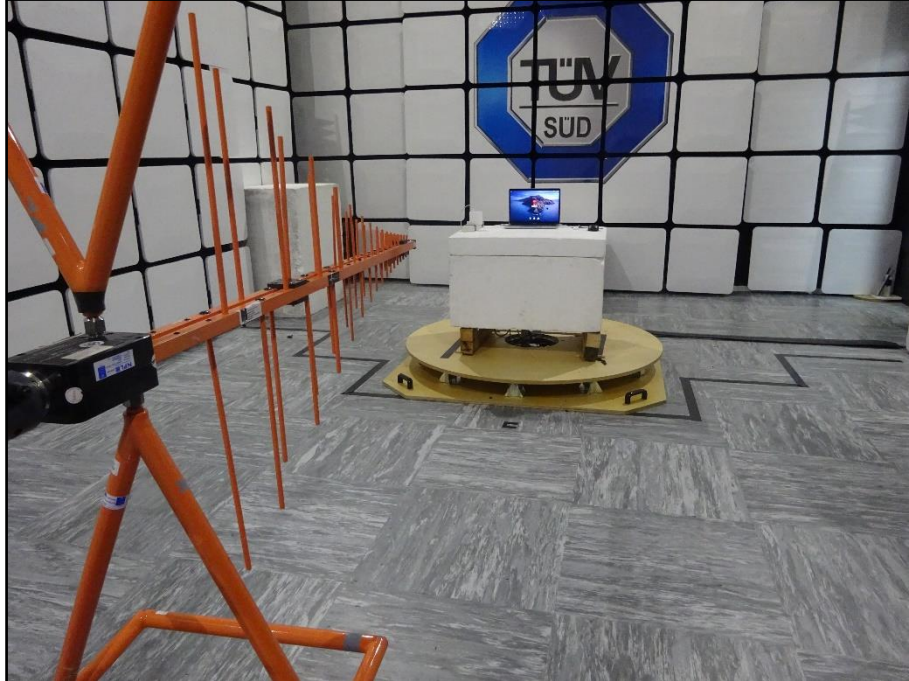
Figure 1 - Radiated Disturbance - Below 1 GHz