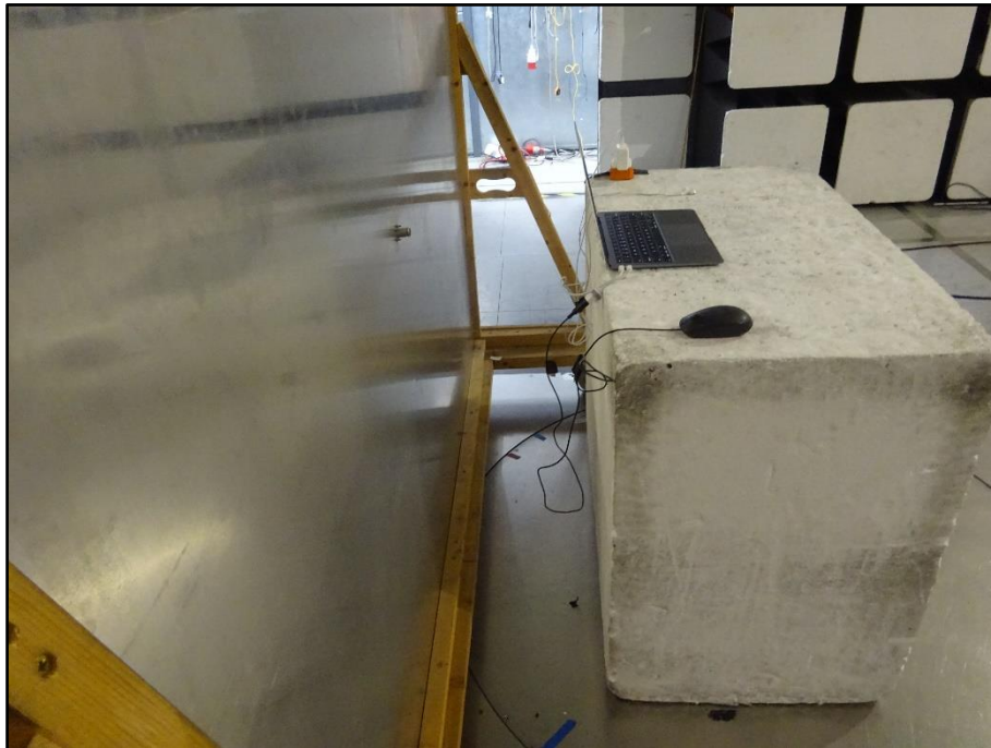
Figure 5 - Conducted Disturbance at Mains Terminals