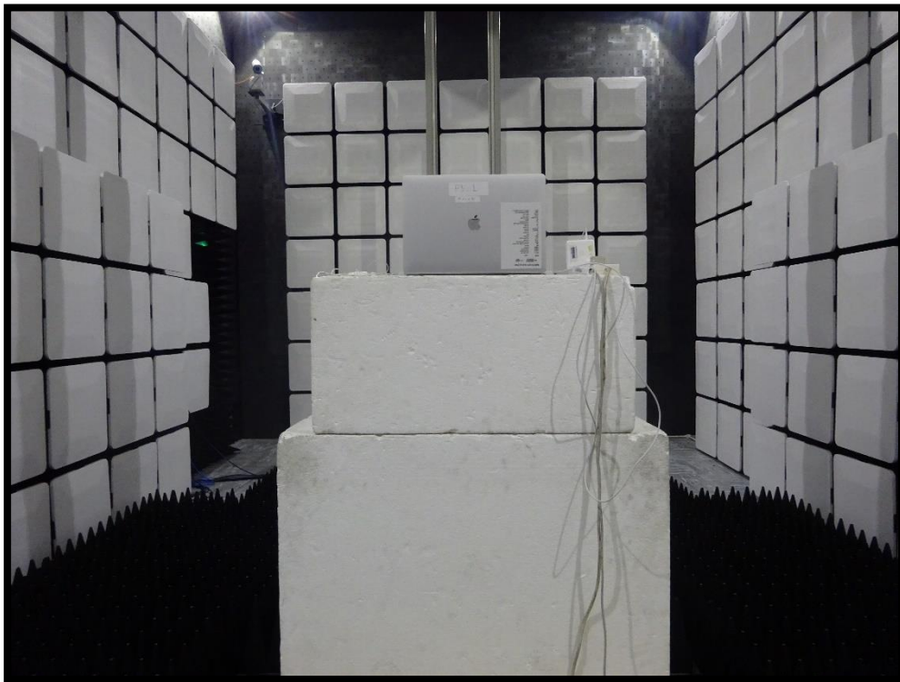
Figure 5 - Radiated Disturbance - Above 1 GHz