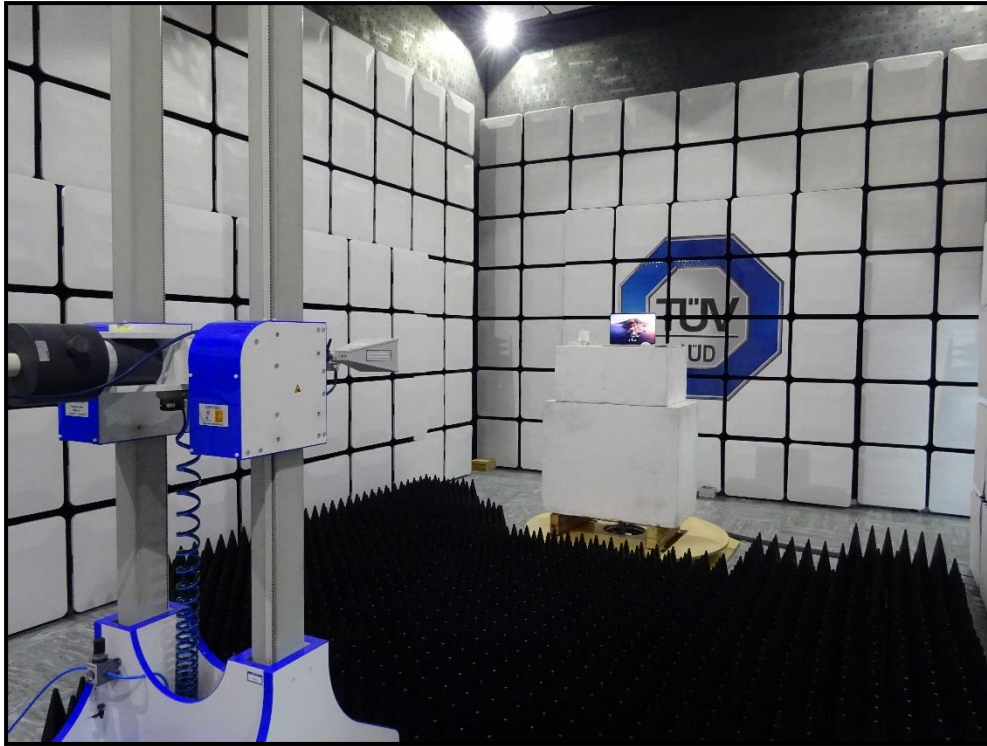
Figure 4 - Radiated Disturbance - Above 1 GHz