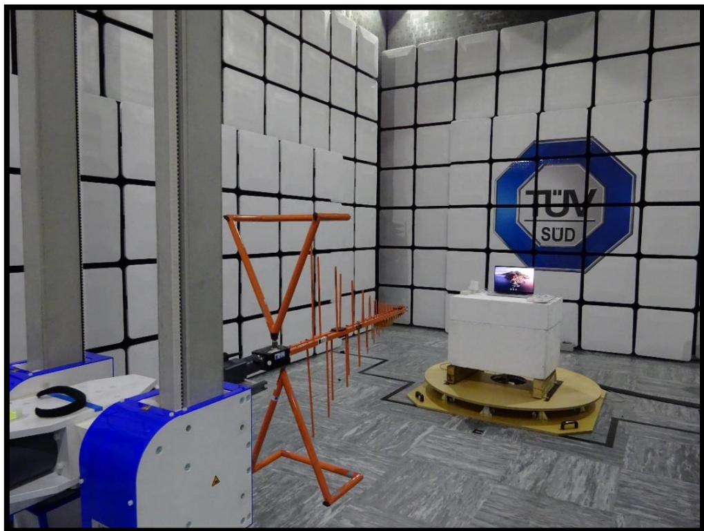
Figure 3 - Radiated Disturbance - Below 1 GHz