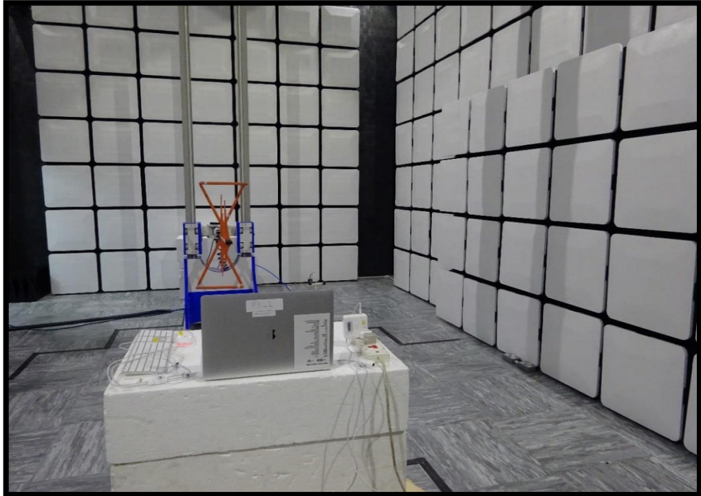
Figure 2 - Radiated Disturbance - Below 1 GHz