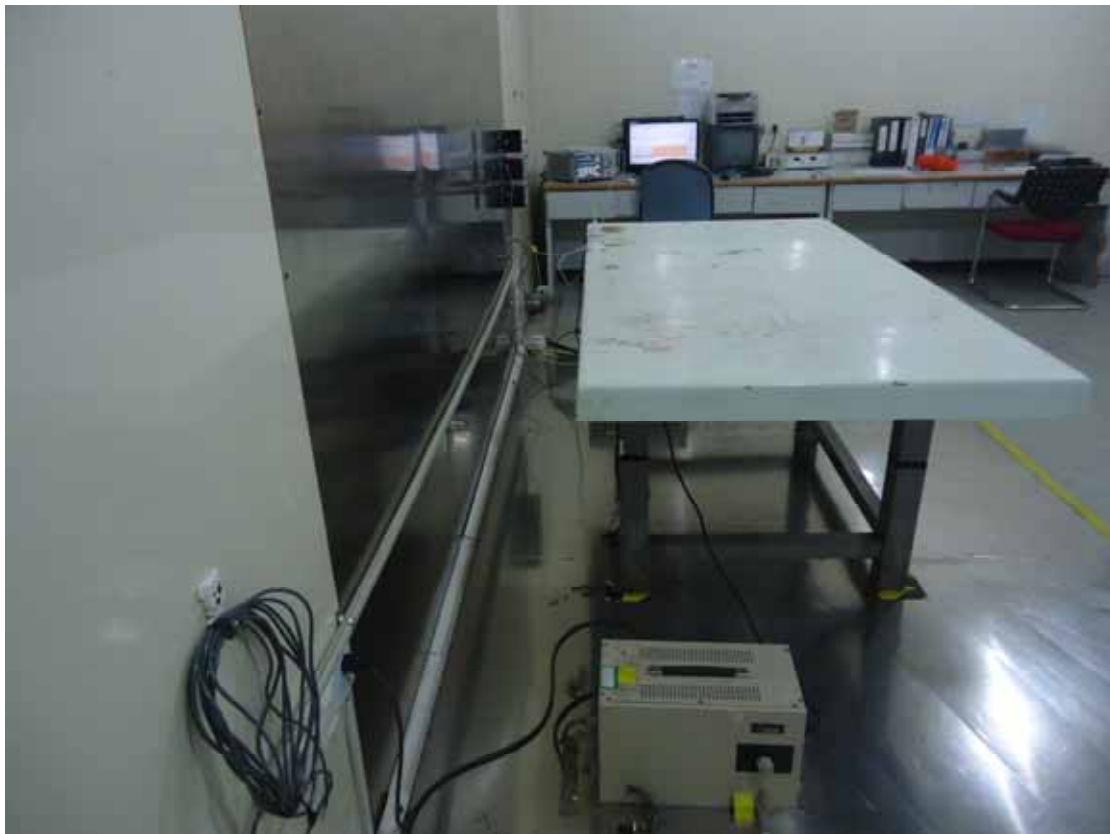
Side View of conducted emission measurement