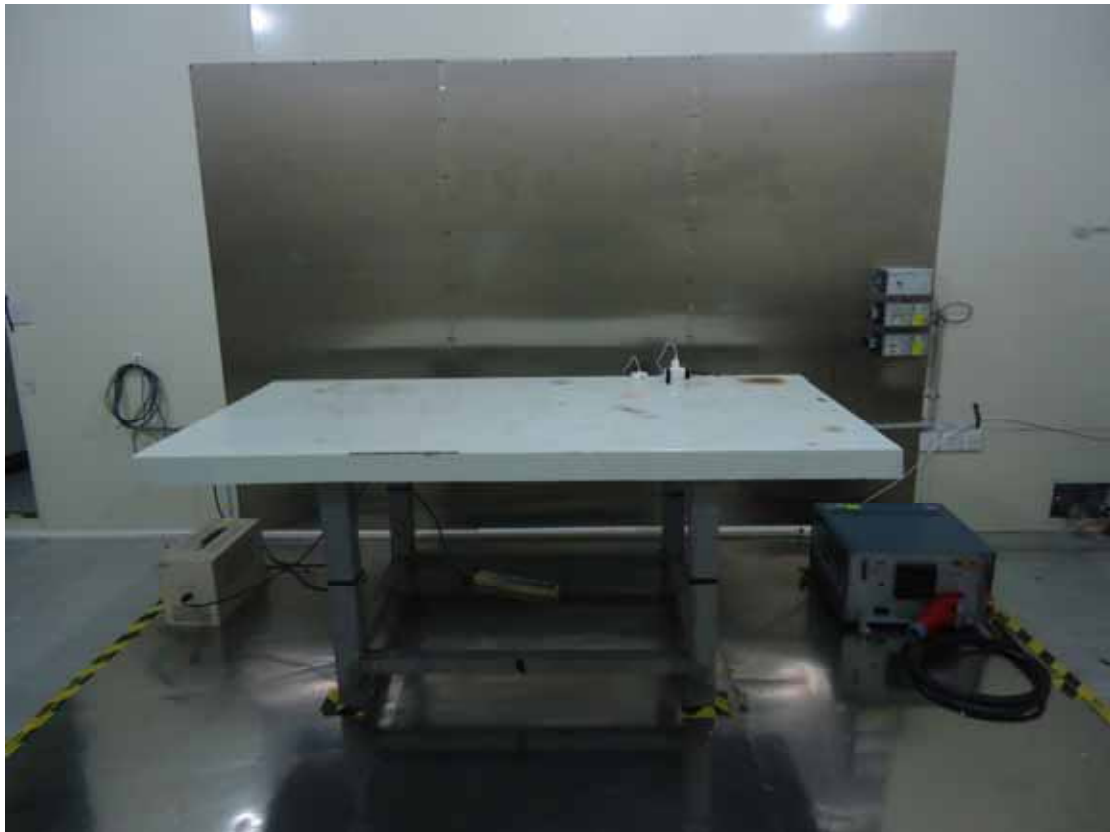
Front View of conducted emission measurement