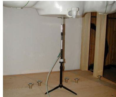
Figure 8-2 System Verification Setup Photo