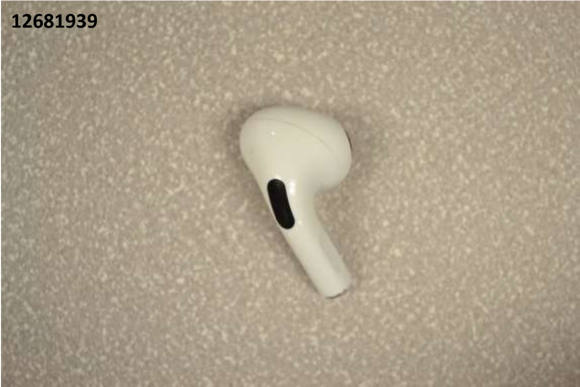
Rear View of the DUT