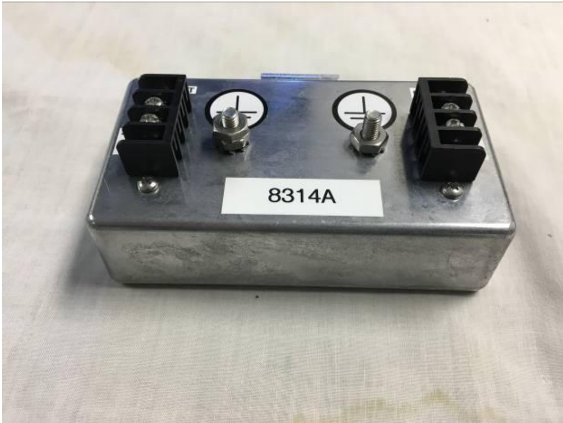
Figure 14. Side 4 of Filter #2

Part 90.242 B7MTR-6000TIS-WB 15-0297 February 4, 2015 RADIO SYSTEMS INC TR-6000