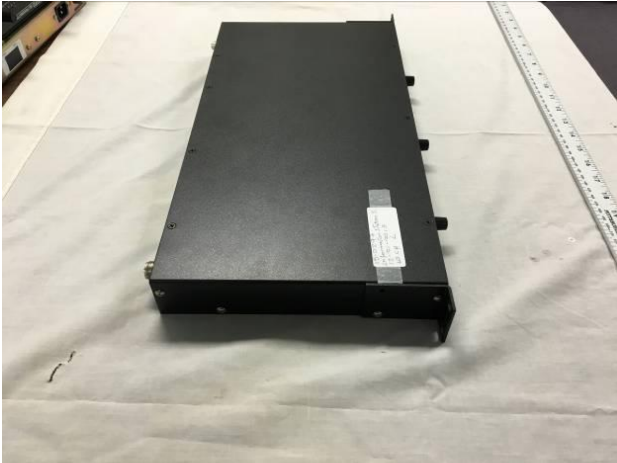
Figure 5. Side 2

Part 90.242 B7MTR-6000TIS-WB 15-0297 February 4, 2015 RADIO SYSTEMS INC TR-6000