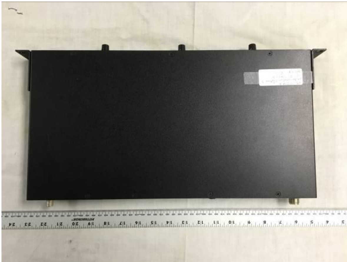
Figure 1. Top of EUT (TR-6000)