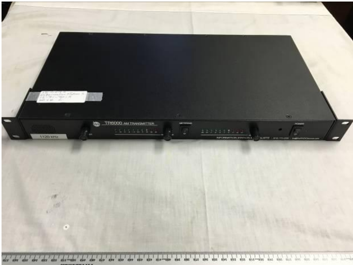
Figure 3. Front Panel

Part 90.242 B7MTR-6000TIS-WB 15-0297 February 4, 2015 RADIO SYSTEMS INC TR-6000