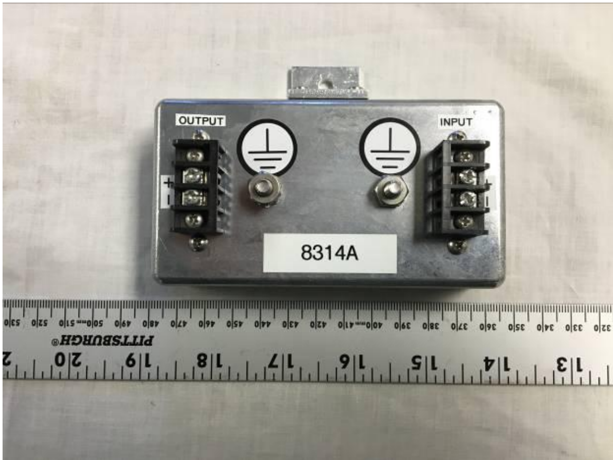
Figure 10. Top of Filter #2 (Passive)