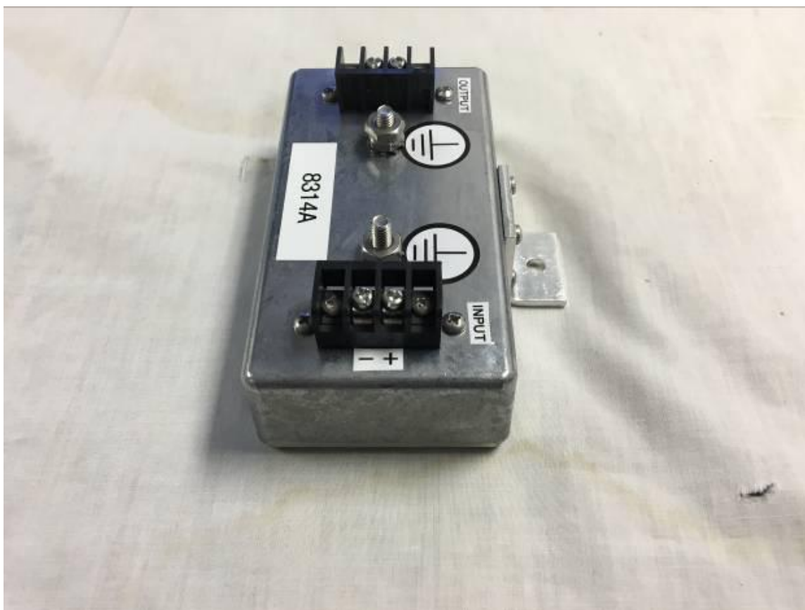
Figure 12. Side 2 of Filter #2

Part 90.242 B7MTR-6000TIS-WB 15-0297 February 4, 2015 RADIO SYSTEMS INC TR-6000