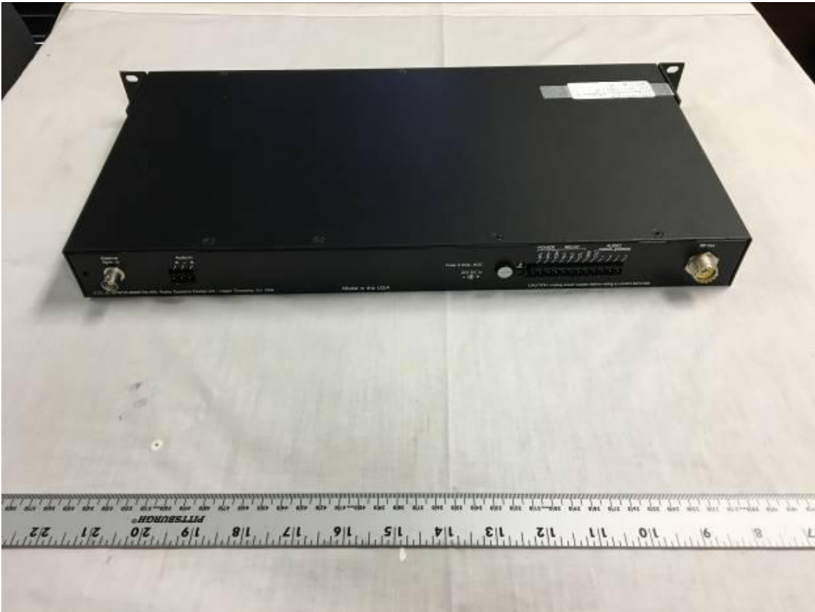
Figure 2. Back of EUT

Part 90.242 B7MTR-6000TIS-WB 15-0297 February 4, 2015 RADIO SYSTEMS INC TR-6000