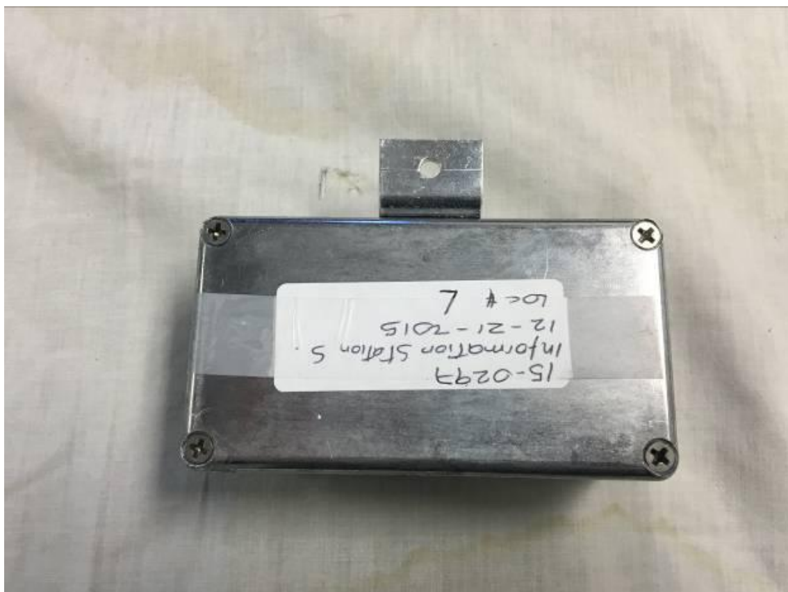
Figure 15. Bottom of Filter #2

Part 90.242 B7MTR-6000TIS-WB 15-0297 February 4, 2015 RADIO SYSTEMS INC TR-6000