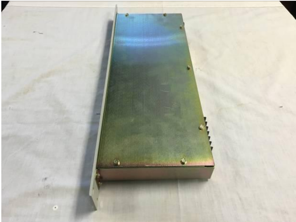
Figure 9. Side 2 of Filter #1

Part 90.242 B7MTR-6000TIS-WB 15-0297 February 4, 2015 RADIO SYSTEMS INC TR-6000