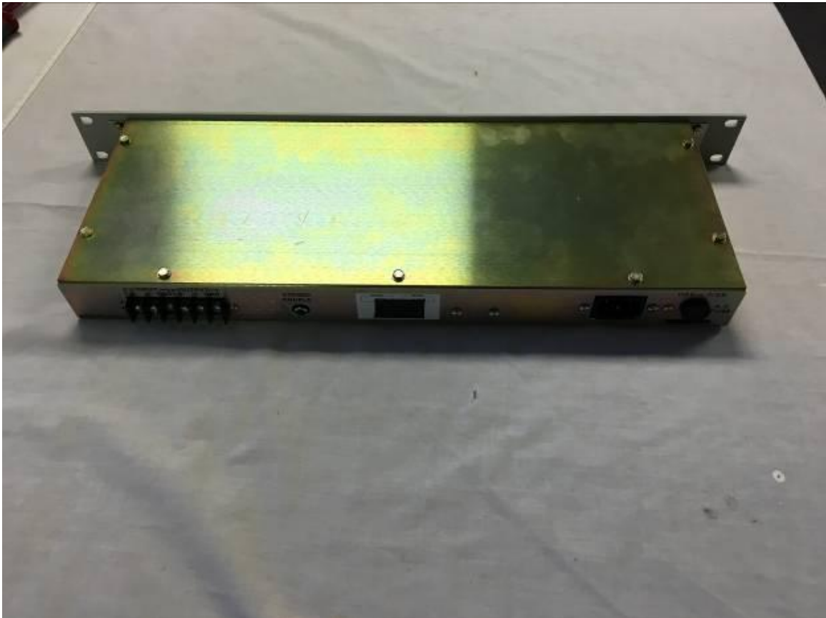
Figure 8. Back of Filter #1

Part 90.242 B7MTR-6000TIS-WB 15-0297 February 4, 2015 RADIO SYSTEMS INC TR-6000