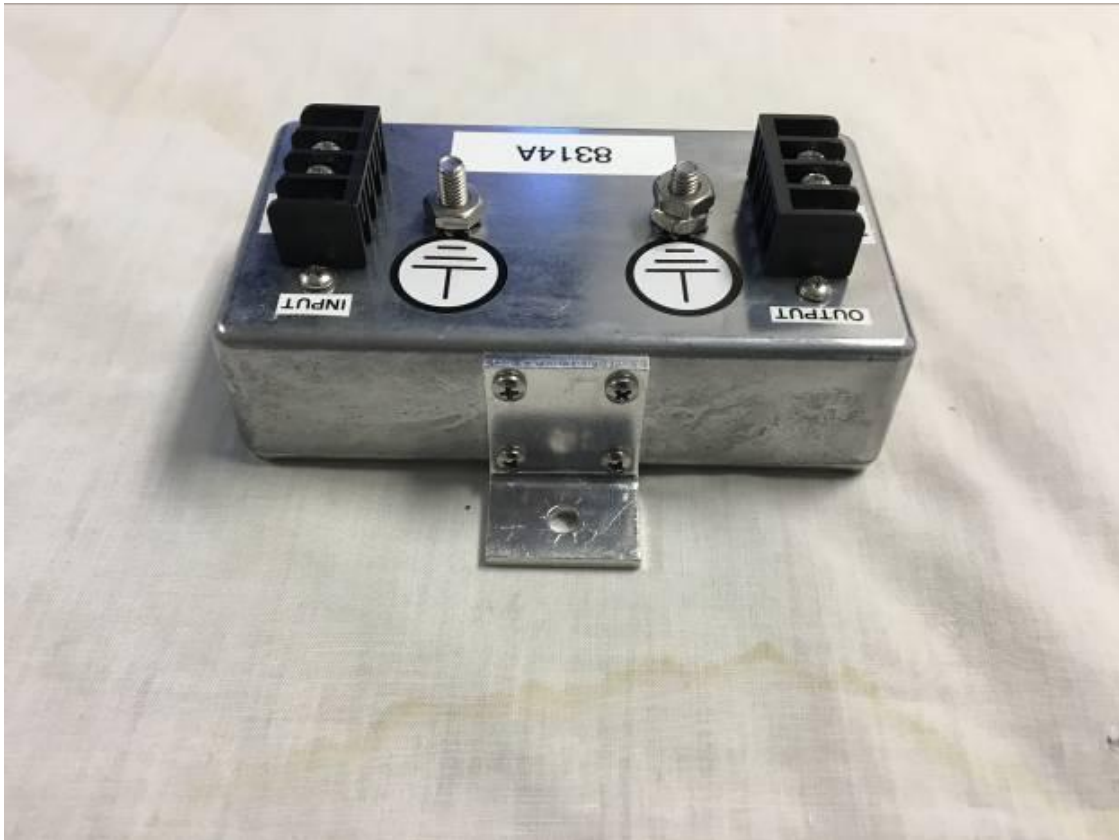
Figure 13. Side 3 of Filter #2

Part 90.242 B7MTR-6000TIS-WB 15-0297 February 4, 2015 RADIO SYSTEMS INC TR-6000