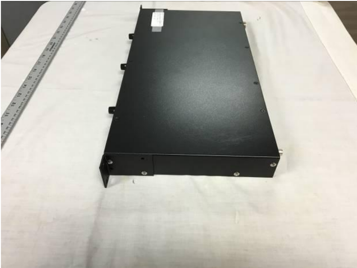
Figure 4. Side 1

Part 90.242 B7MTR-6000TIS-WB 15-0297 February 4, 2015 RADIO SYSTEMS INC TR-6000