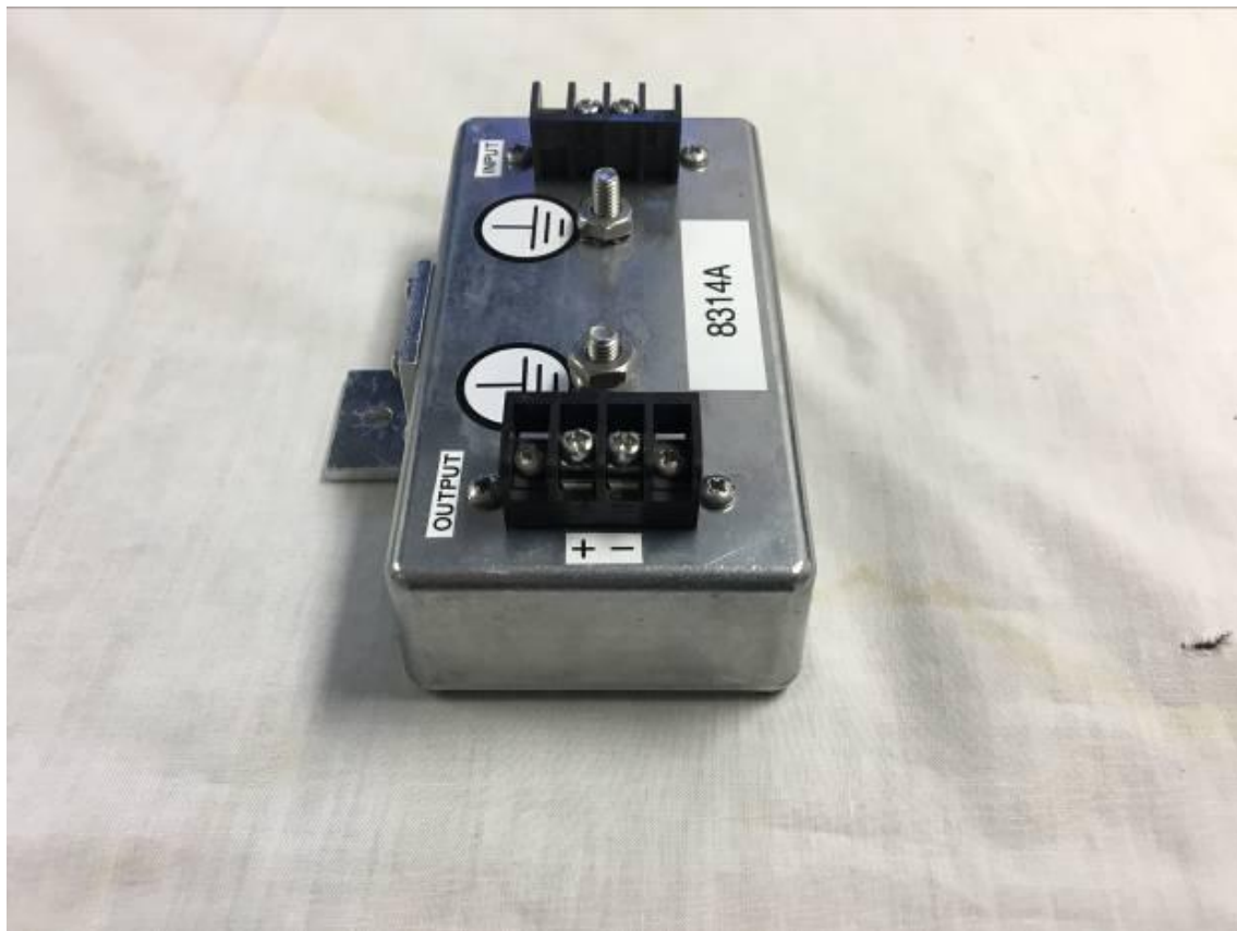
Figure 11. Side 1 of Filter #2

Part 90.242 B7MTR-6000TIS-WB 15-0297 February 4, 2015 RADIO SYSTEMS INC TR-6000