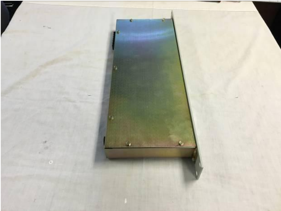
Figure 7. Side 1 of Filter #1

Part 90.242 B7MTR-6000TIS-WB 15-0297 February 4, 2015 RADIO SYSTEMS INC TR-6000