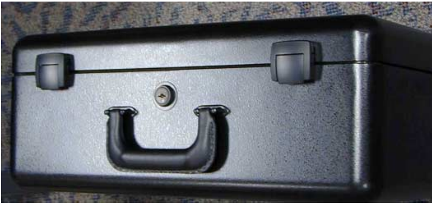
UNIT IN CLOSED CASE